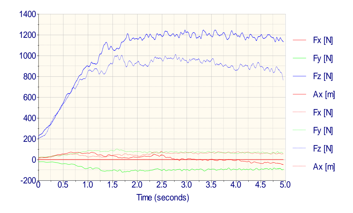
Figure 1. An example plot of leg force as a function of time during the isometric mid-thigh pull clean trial for one subject. Blue curve indicate vertical right leg force development. Scattered blue curve indicate vertical left leg force development. Red curves indicate horizontal force development, and green curves indicate lateral force development.

Vertical ground reaction force data were sampled at a rate of 1000 Hz. A special routine was built in Matlab R2007a (The MathWorks Inc., Natick, MA) which calculated the abovementioned strength and power variables. This made it possible to collect force characteristics from right, left and both legs. Figure 1 illustrates the force-time curve of one subject and reflecting force-time curves to all of the subjects.