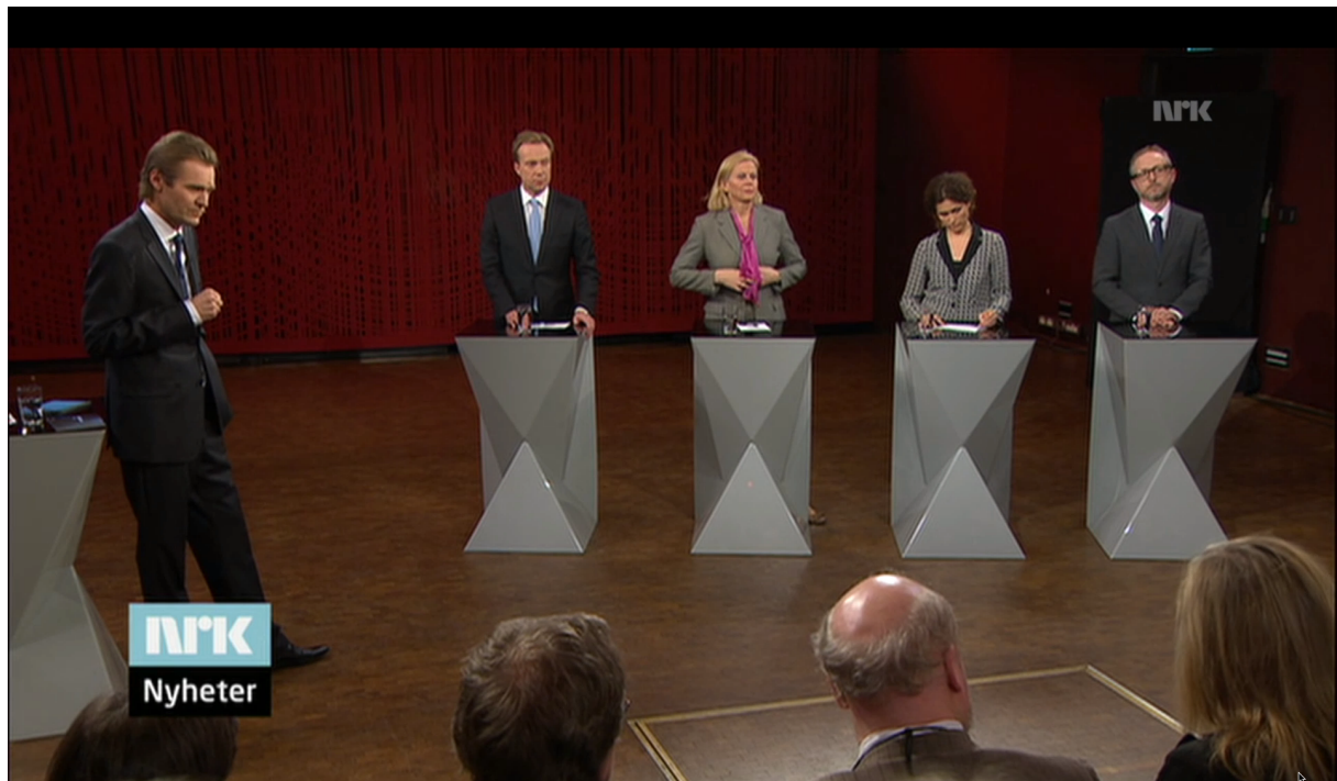
Note. From NRK. (2014, March 3).