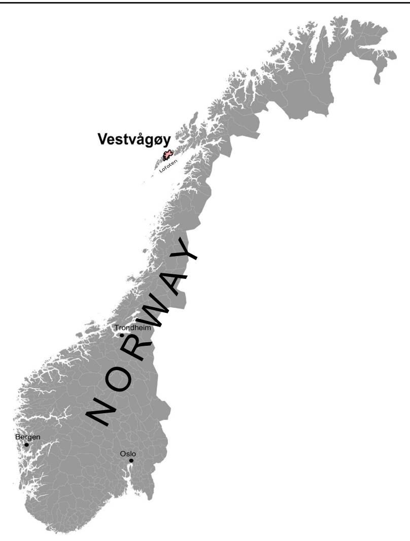
Fig. 2 The case study site, Vestvågøy municipality, Nordland County, Norway

climate projections and local observations of weather changes we would expect the inhabitants to worry about the impacts of climate change (Kvalvik et al. 2011; Hovelsrud et al. 2010).