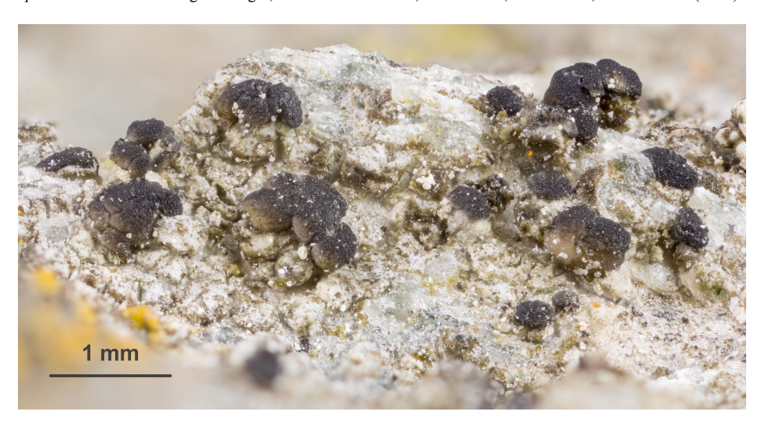
Figure 2. Catillaria aphana, Klepsland 15-L408a (TRH).

Specimen: Nord-Trøndelag: Flatanger, Dale Nature Reserve, 64.44319°N, 10.96519°E, Jonsson 6269 (TRH).