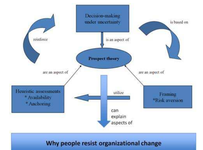
Fig. 1. Prospect theory as an explanation of why people resist organizational change

The content of this article is summarized in Fig. 1, which also shows how the article is structured. This article also includes a separate section that explains concrete measures that may be taken by management. These measures are based on the seven propositions developed during the course of this article.