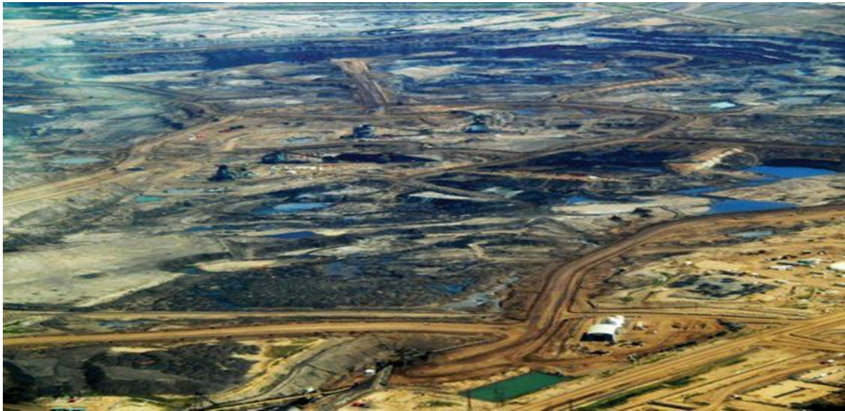
Expanse of oil sands mining.

1967 till today. “Thick, sticky bitumen – a semi-solid form of petroleum – is extracted from the