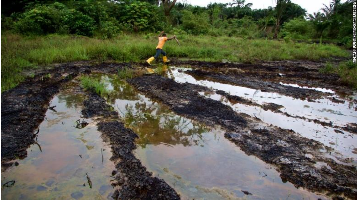
A man jumps across water dirtied by oil pollution in Ogoniland, Nigeria.

It is not surprising that when many proponents of the resource curse theory argue for the validity of the theory, Nigeria is in many cases, included with other countries as examples, when these authors claim that many countries endowed with natural resources are affected by the curse. One of the reasons Nigeria can be used as an example is because of the negative effects of oil development in the Nigeria Delta. “The region’s economic and human deprivation stands in contrast to other parts of the country, creating a paradox of poverty in the midst of plenty” (Nwoke 2010, 91).