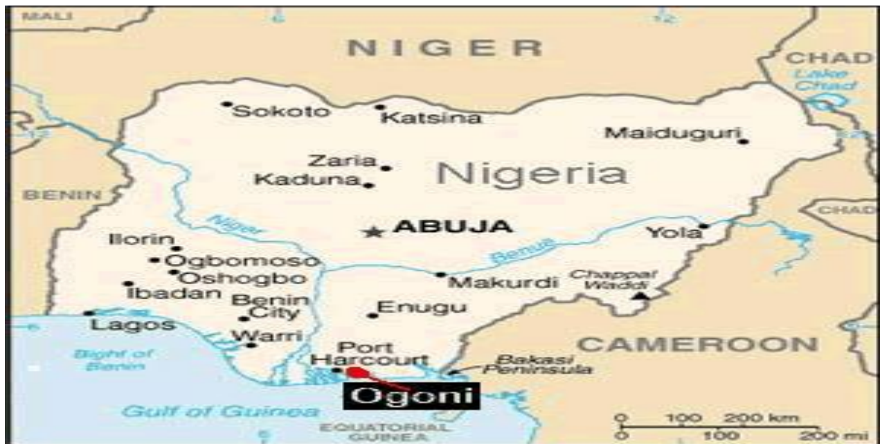
Map Source: Movement for the Survival of Ogoni People