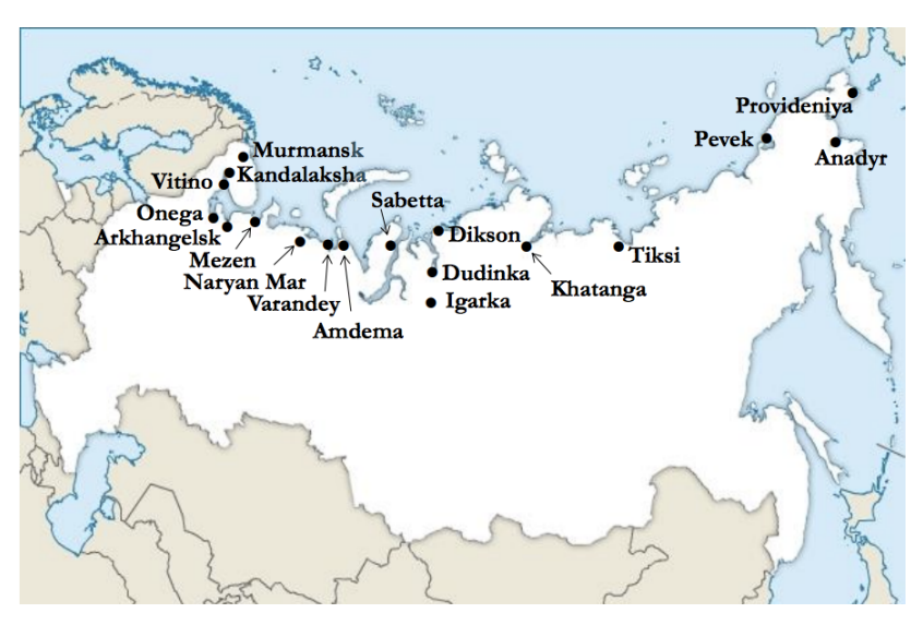
Figure 1, Russian Arctic ports

The development of the NSR's infrastructure and supporting services is included in the Transport Strategy of the Russian Federation up to 2030 (see Shcherbanin, 2013 and www.government.ru/en/dep_news/13191/ for details). Furthermore, there is a plan to develop Murmansk into a major transport hub, with planned construction of oil and coal terminals, container terminal, facilities to handle fertilizers, and a new railroad (www.rosmorport.com/mur_developmentofports.html). Planning is underway to develop Dvina Gulf (located on the White Sea 55 km north of the city of Arkhangelsk) into new deep-water seaport, operating year-round and servicing vessels up to 100,000 dwt and transporting up to 30 million tons of cargo annually by 2030 (www.rosmorport.com/arf_developmentofports.html). Container shipping is seen as a key component of the new port.