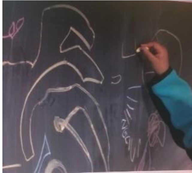
Figure 1. Lines, ornaments and numbers, where there is place.

He asks the children if they want to get up on a chair and write their names on the blackboard. Quiet, a solemn atmosphere, while one after the other comes forward and writes. Applause for everyone who finishes it. Ceremony, perhaps because they stay elevated on a chair, the hands are filmed, there is an audience, it might seem exciting? (Researcher journal, entry 2, 11.03.11)