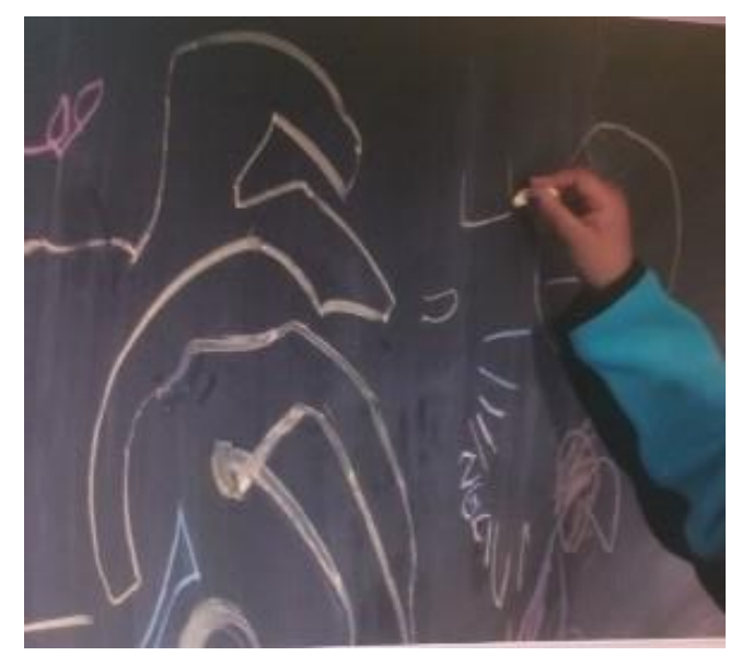
Figure 1. Lines, ornaments and numbers, where there is place.

He asks the children if they want to get up on a chair and write their names on the blackboard. Quiet, a solemn atmosphere, while one after the other comes forward and writes. Applause for everyone who finishes it. Ceremony, perhaps because they stay elevated on a chair, the hands are filmed, there is an audience, it might seem exciting? (Researcher journal, entry 2, 11.03.11)