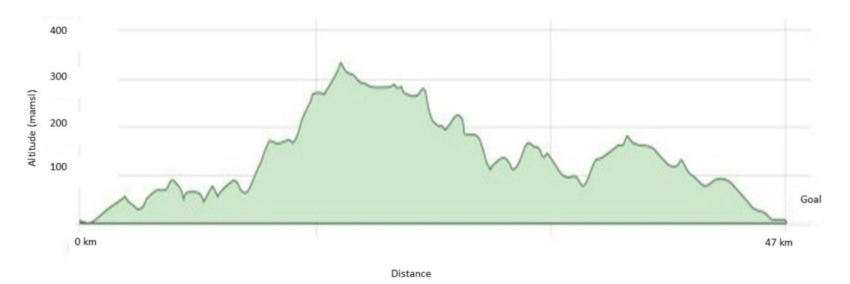
Figure 1. Race profile for the mass-start mountain bike race. Total distance: 47 km. Total elevation: 851 m. Altitude: 3–338 meters above mean sea level (MAMSL).

The official race was a mass-start 47 km mountain bike race, where the first 22 km contained several uphills and the rest was mainly flat or downhill (see Figure 1 for race profile). Total elevation was 851 m. In the official competition, an electronic timing system (emit) was used. Performance in this mass-start 47 km bike race was tested by a system that included a radiofrequency identification timing tag attached to the participants. A radiofrequency identification reader/controller with antenna assembly (EQ Timing) captured the participants' race time.