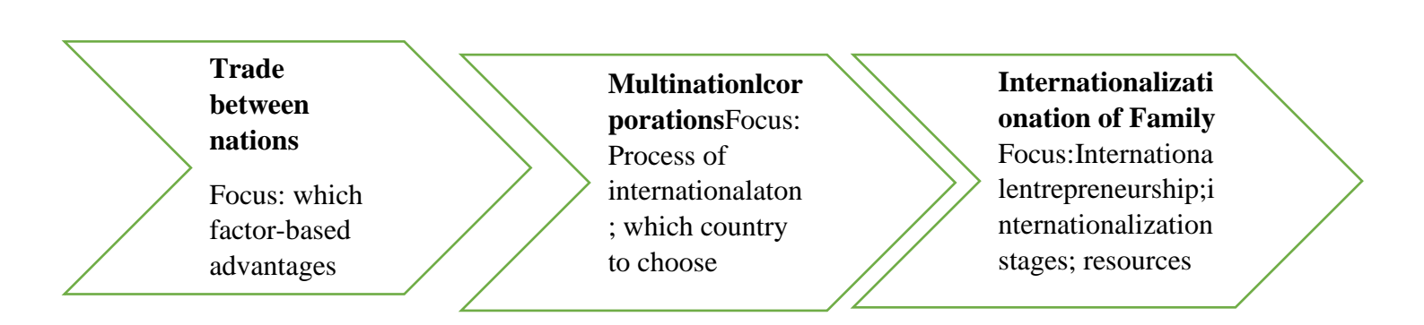
Figure 2.1: The overview of focus shift in internationalization literature (Oyuntugs & Vithange, 2019)

Figure 2.1 illustrate the focus change of internationalization literature as further explained. Although various studies on international trade are done to understand about the internationalization process of family firm, but they do not focus deeply about the growth process since their aim was to study on a national level, not on an individual level. Later, researcher start focusing their research on multinational companies (Hymer, 1960) and the process of internationalization Johansson & Vahlne (1977), explaining about which country the family firm should choose to internationalize. Subsequently, after the deep analysis and study of international entrepreneurship the traditional international theories were challenged and after that various new prospective of studying internationalization were generated (McDougall et al., 2003)