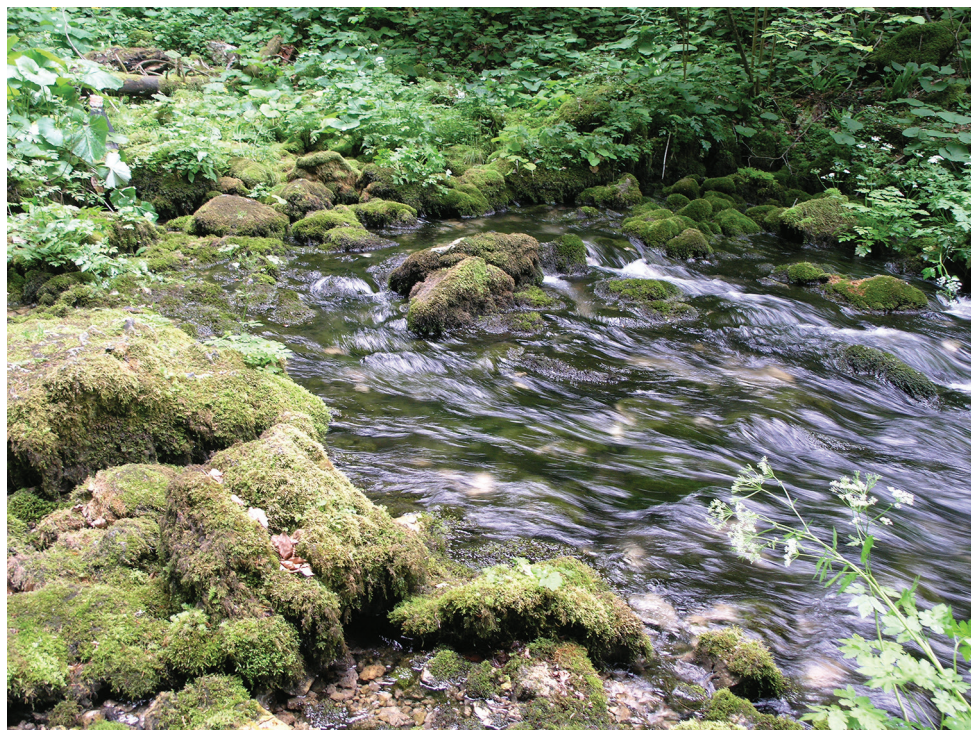
Figure 2. Spring of Crna Rijeka, Plitvice Lakes National Park.