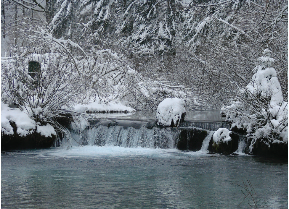
Figure 3. Crna Rijeka by the bridge, Plitvice Lakes National Park.