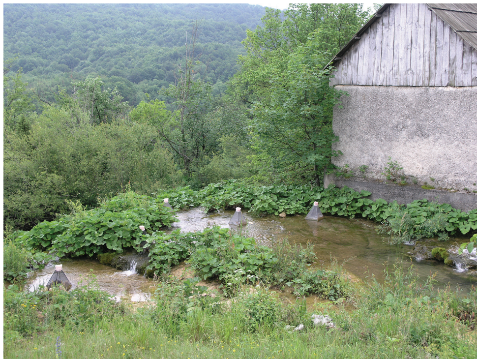
Figure 7. Stream Plitvica, Plitvice Lakes National Park.