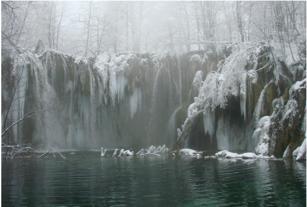
Figure 5. Tufa barrier Galovac-Milino, Plitvice Lakes National Park.