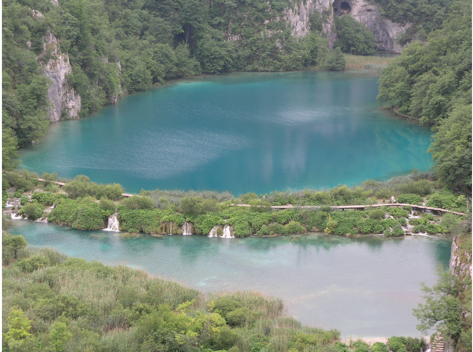
Figure 6. Lake Kaluđerovac and Tufa barrier Novakovića Brod, Plitvice Lakes National Park.