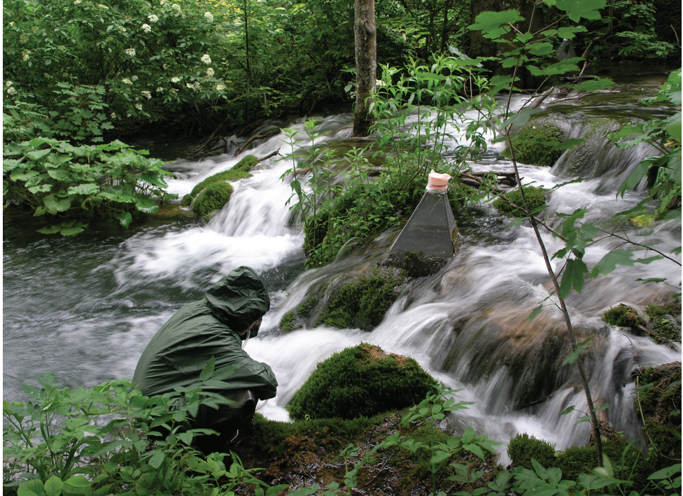
Figure 4. Tufa barrier Labudovac, Plitvice Lakes National Park.