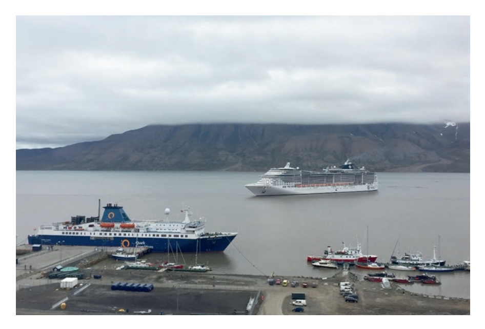
Fig. 14.2 MSC Preziosa, with over 5000 passengers, arrives at the port of Longyearbyen, Bykaia (Town Pier). August 2017.