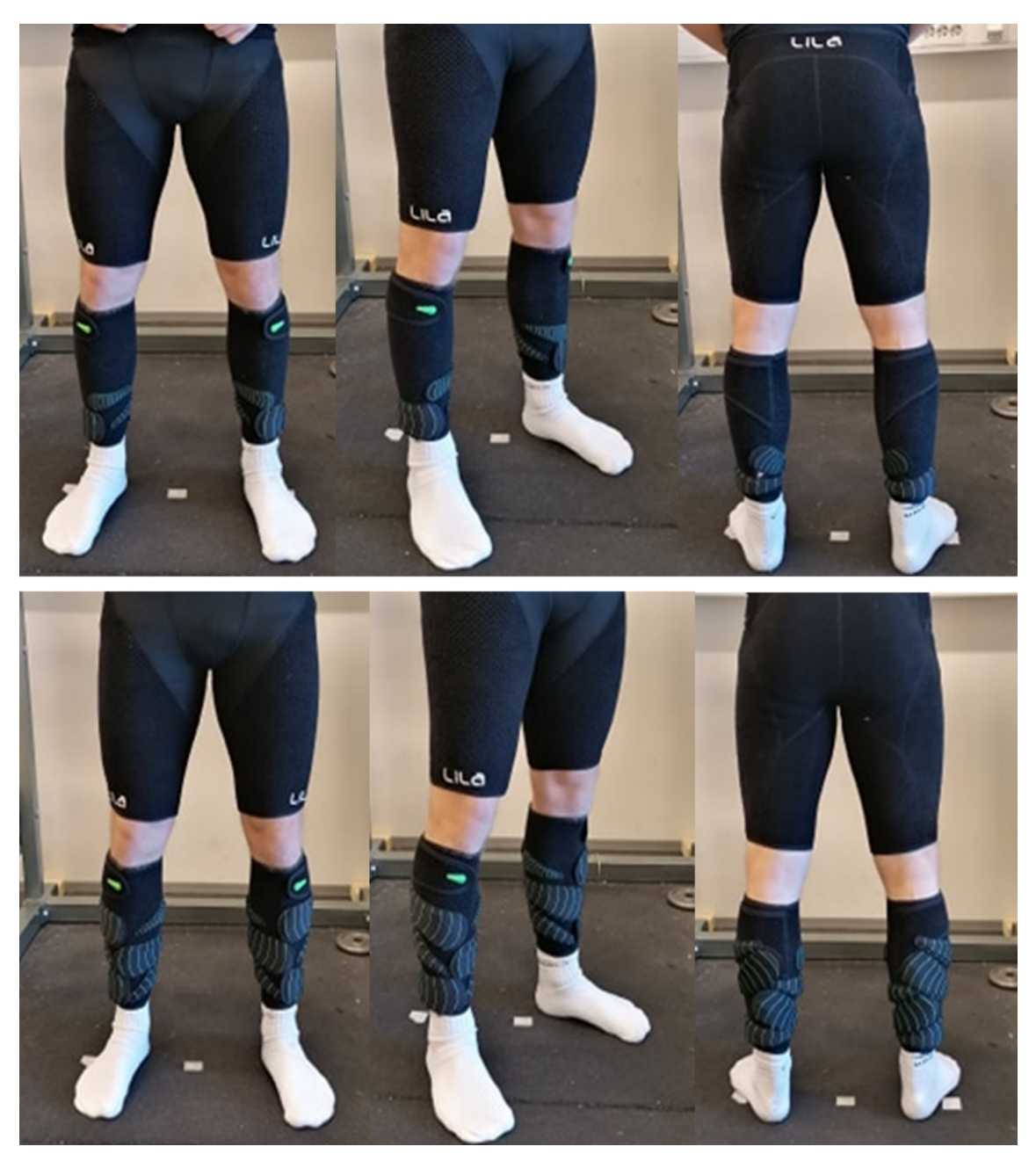
Fig 2. Illustration of 1 and 3% BM resistance with shank condition for a 70 kg football player. https://doi.org/10.1371/journal.pone.0242493.g002

only used on the thigh condition. Placement of the loads was in accordance with the loading scheme protocol of Field [25], but with some practical modifications. Loads were placed from most distal to proximal on the leg. The first load was attached horizontally, laterally and at the most distal point with the heaviest part placed anteriorly on the leg, while the next load was placed the opposite way (medial) with the heaviest part posterior on the leg. Additionally, the thigh condition loads were placed more laterally to avoid affecting the natural running gait during the heaviest loading (Figs 2 and 3).