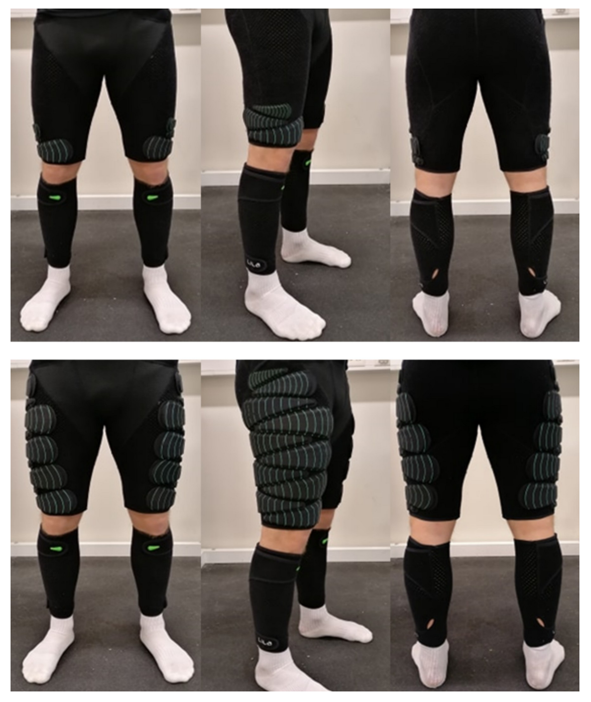
Fig 3. Illustration of 1 and 5% BM resistance with thigh condition for a 70 kg football player.

https://doi.org/10.1371/journal.pone.0242493.g003