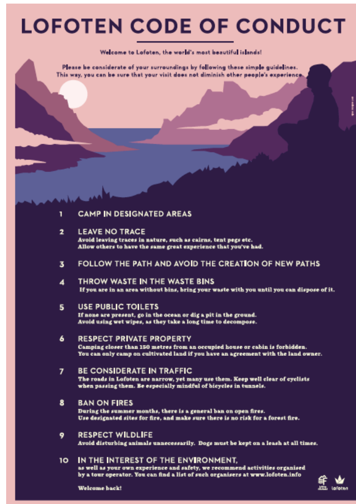
Figure 2: Lofoten Code of Conduct