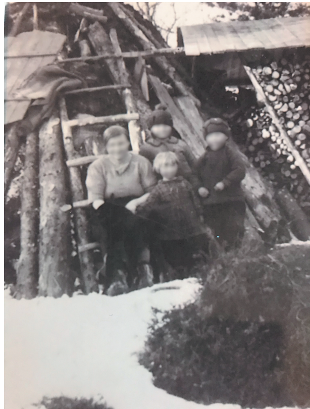
Photo 3. Well-being through connection to the family.

This participant had felt the importance of family since being a child and said: "You just know it (when