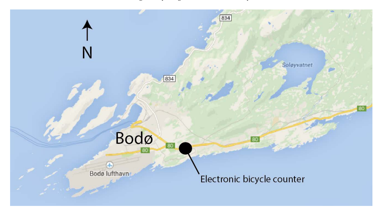
Figure 1. Location of the electronic bicycle counter.