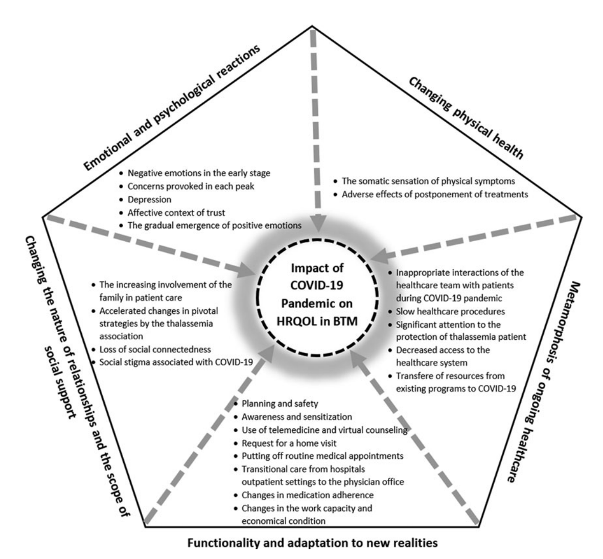
Figure 3. Themes and subthemes developed in this study

P16: "Injecting seasonal flu vaccine for free by the healthcare system alleviated my concern. It showed that thalassemia patients are not neglected." (Male, 29 years old)