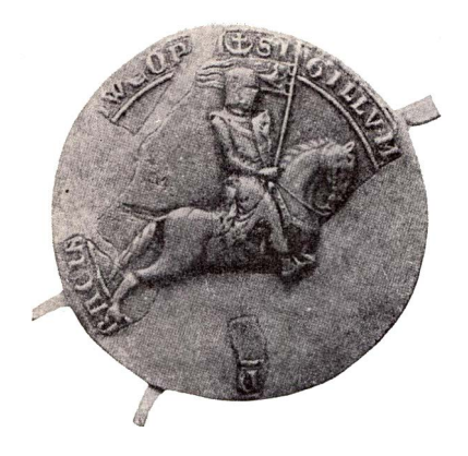
Figure 5. Birger Jarl's seal. By the mid-13<sup>th</sup> century, the Scandinavian aristocracy presented itself as fully integrated with the rest of Europe. This seal depicts Birger Magnusson, jarl of Sweden c. 1248–66. The jarl, heavily armoured astride a warhorse, is virtually indistinguishable from contemporaneous Continental portrayals of warring aristocrats. CCO

The evolving military organisation and its appropriation of existing martial institutions had a substantial impact, especially from a socio-economic perspective. The naval levies of the late 13<sup>th</sup> century had become a source of revenue for the Scandinavian kings as a result of warfare transforming into an aristocratic business to a degree hitherto unseen in the region. The importance of Continental European innovations such as castles and heavy cavalry tactics had made waging war increasingly expensive, and it could only be efficiently conducted by the aristocratic strata and consequently the peasantry's participation in mili-