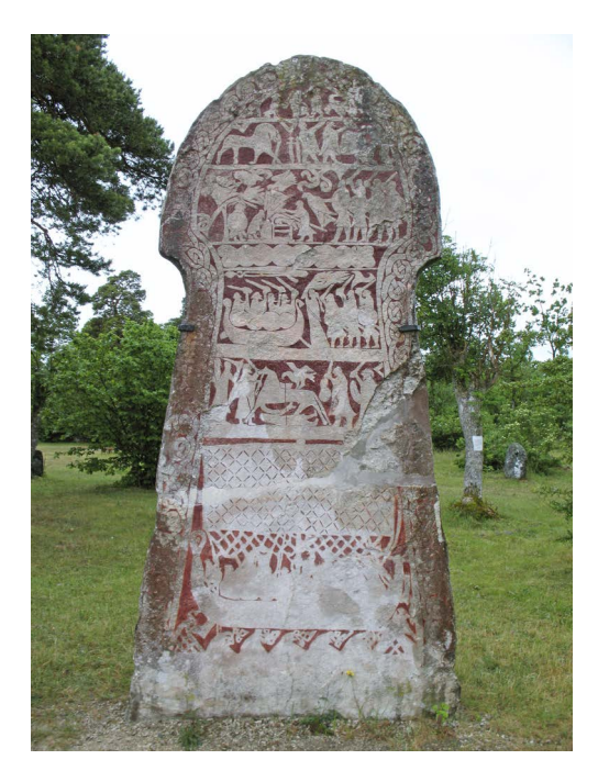
Figure 4. Stora Hammars I. The Gotlandic picture stones of Stora Hammars contain one of the very few contemporary battle depictions from the Viking Age. The Stora Hammars I picture stone shows a large ship under sail and several instances of battles, although details about equipment or specific practices are difficult to discern. CCO

In the first row he would put two men, four in the second, then increase the third to eight, and step up each succeeding rank by doubling the numbers of the one in front (Friis-Jensen and Fisher 2015: I: 66–9).