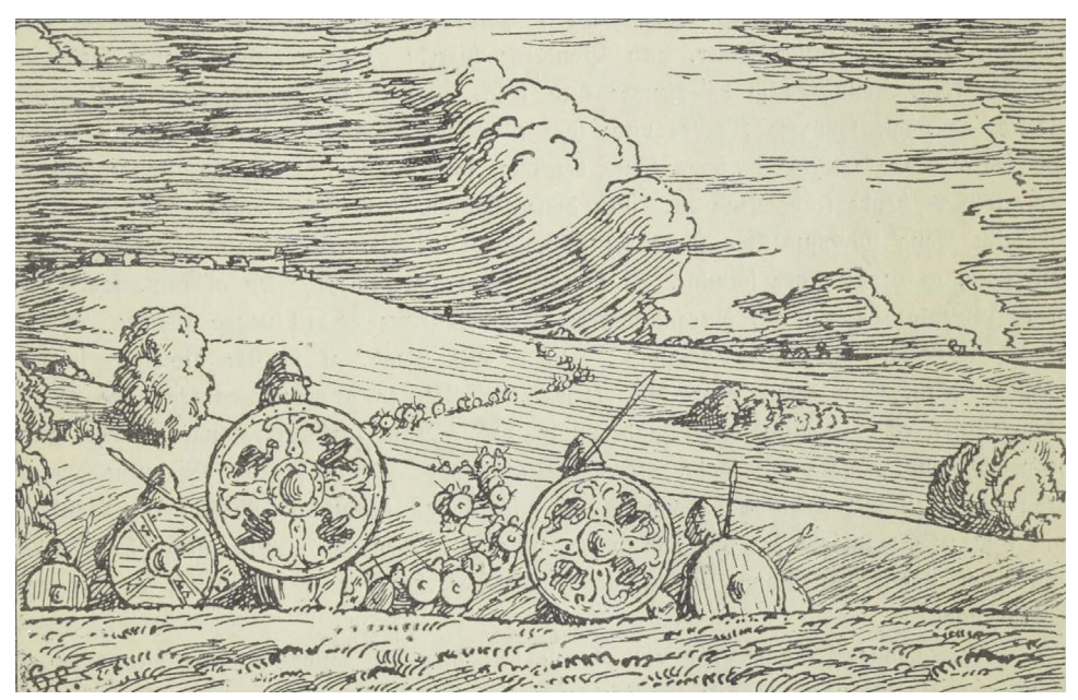
Figure 2. The leiðangr underway. Artist's rendition of the leiðangr mobilising in Trøndelag during Magnús góði's reign. Illustration by Halfdan Egelius for the 1899 edition of Heimskringla. CCO

Through the evolution of legislation in Denmark it is possible to discern how the naval levies changed during the Valdemarian period (c. 1157–241) and it also provides clues to the nature of the Danish lething before this period. The first Danish law that contains information about the naval levies is the Law of Skåne (Danish: Skånske lov ) written sometime between 1202 and 1216, which describes a lething system that has almost entirely replaced military service with taxation. Moreover, the Law of Jylland (Danish: Jyske lov ) promulgated in 1241, includes further specifications and regulations on lething taxes, and it also displays an even steeper trend towards centralisation (Tamm and Vogt 2016: 47–9, 238–9). The earliest reference to this amendment is found in book XIV, chapter 39 of Gesta Danorum , and according to Saxo: