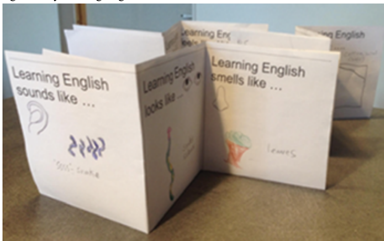
figure 1 My learning English senses book

Our study was embedded in a children's rights perspective, which values children's voices, in this case, their perceptions of learning English in an out-of-school context. This includes 'using more participatory methods where adults give children the opportunity to express their views, help them express their views, listen to their views and act on their views as appropriate' (Ellis 2019: 25). When eliciting young children's views, a variety of age-appropriate methods made as practicable as possible is required so that language is not a barrier. The younger the child, the greater the importance of techniques that engage children's interests and minimize adult dominance. Hence, we need a variety of modes which allow children to express themselves via drawing, photographs, and movement. The mosaic approach (Clark 2017) was used to inform our methodology. This is a pedagogy of listening that acknowledges children and adults as co-constructors of meaning. It is an integrated approach which combines the visual, via drawing in this study, with the verbal, when children explained their perceptions to us. There was also a tactile dimension in the form of the creation of a folding zig-zag book (Figure 1) which provided an affective, personal record of their early language learning experiences, as well as a concrete outcome to share with their families.