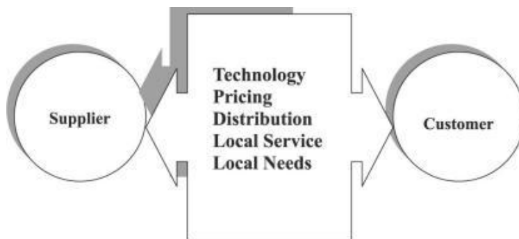
Figure 3: Variables that needed to be adjusted in an international marketing strategy (Rundh 2003).

Rundh (2003) also emphasizes the need and importance of adjusting standardized marketing strategies because of the factors i.e. social/cultural, Legal, economic, political and technological, as discussed by Doole & Lowe (2008). According to Rundh (2003) following variables need to be adjusted in an international marketing strategy: