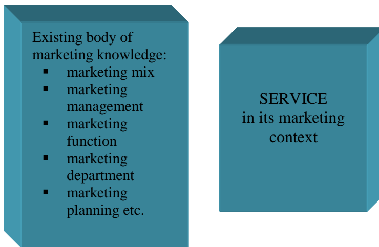
Figure 2: Comparison of Nordic School approach with the Main-stream approach in the context of studying service (Grönroos 2007).

WHAT SHOULD MARKETING CONCEPTS AND MODELS LOOK LIKE TO FIT IN?