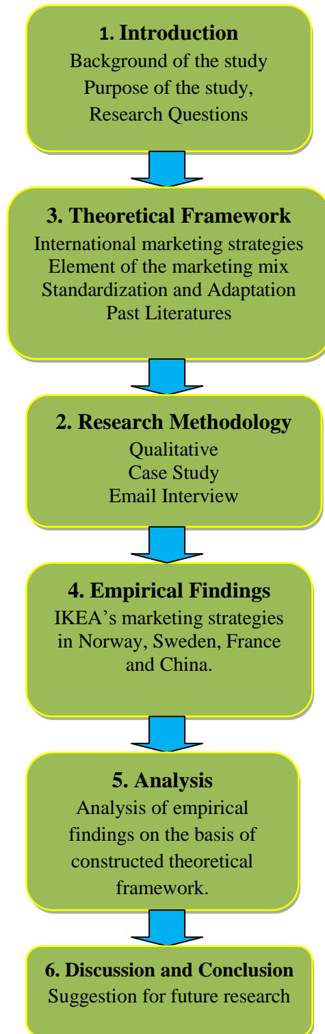
Figure 1: Thesis Outline