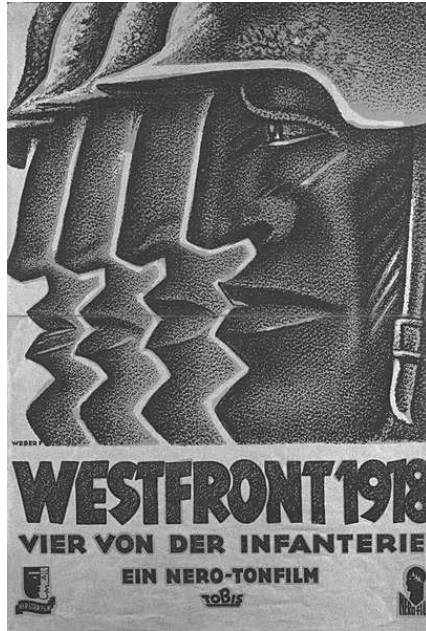
Fig. 1: Movie Poster Westfront 1918 .

War but also, with some specific variations, for the Vietnam War in unusual movies like Francis Ford Coppola's Apocalypse Now (1979) and Michael Cimino's The Deerhunter (1978), extending to Oliver Stone's Platoon (1986) and Stanley Kubrick's Full Metal Jacket (1987) (although Vietnam created the opportunity to implement some specific variations). 5