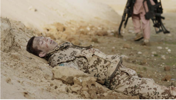
Fig. 1: Omer Fast, Continuity , 2012. Film still.

Avail Themselves (The Disasters of War, 1810–1820) is a contemporary version of the history painting. Susan Sontag sees in the staging of this scene—where the mutilated, bloody bodies of Russian soldiers are represented as they laugh and chat—the ability to depict reality more precisely.