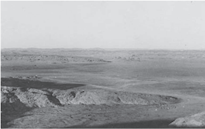
Fig. 2: View of the desert near Wejh; T.E. Lawrence Collection, Imperial War Museum, Q 59014.