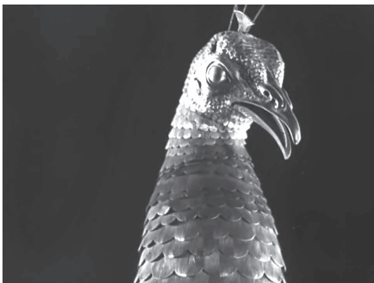
Figs. 1 and 2: Snakes in Il grido dell'aquila and mechanical peacock in October .