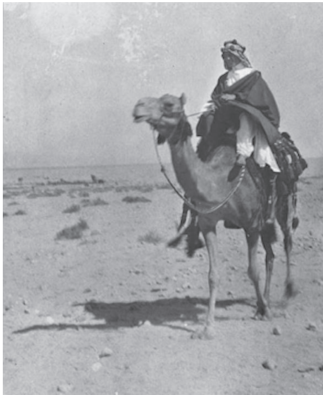
Fig. 5: Lawrence on a Camel, Akaba, n.d.; T.E. Lawrence Collection, Imperial War Museum, Q 60212.