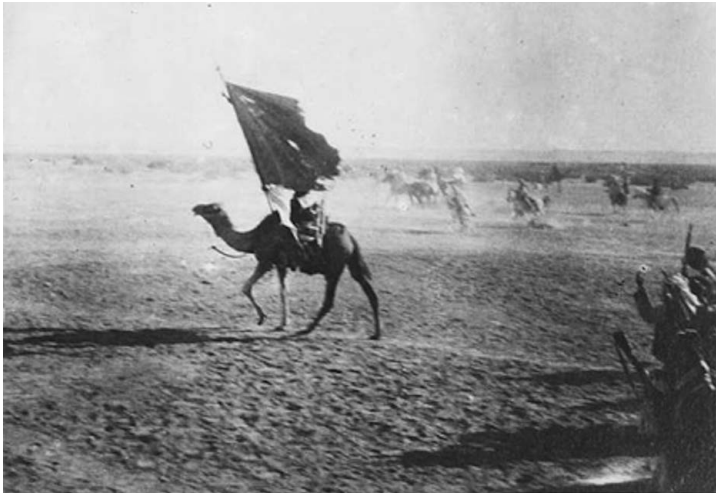
Fig. 9: The triumphal entry into Akaba, 6 July 1917, T.E. Lawrence Collection, Imperial War Museum, Q 59193.

the Emperor's forces in their surprise appearance, 125 almost like a massive wall of camels when they hit the enemy lines during a full-speed advance. 126 As efficient mounted forces, the description of the sandworms and their final attack consequently closely match Lawrence's story about camels and their use during his campaigns.