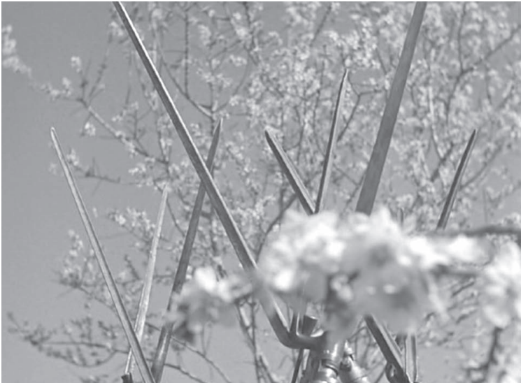
Figs. 3 and 4: Different focus in the same shot.