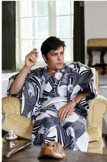
Fig. 6: Alain Delon in a kimono on the set of Diaboliquement vôtre (1967, dir. Julien Duvivier) with an Asian mask and an opium pipe on the coffee table.

derwear for the lady of the house, Christine. Such a perversion of the Other only serves to enhance Delon's sensible, straight French sexuality, as his character longs for actual intercourse that will, he hopes, produce four children.