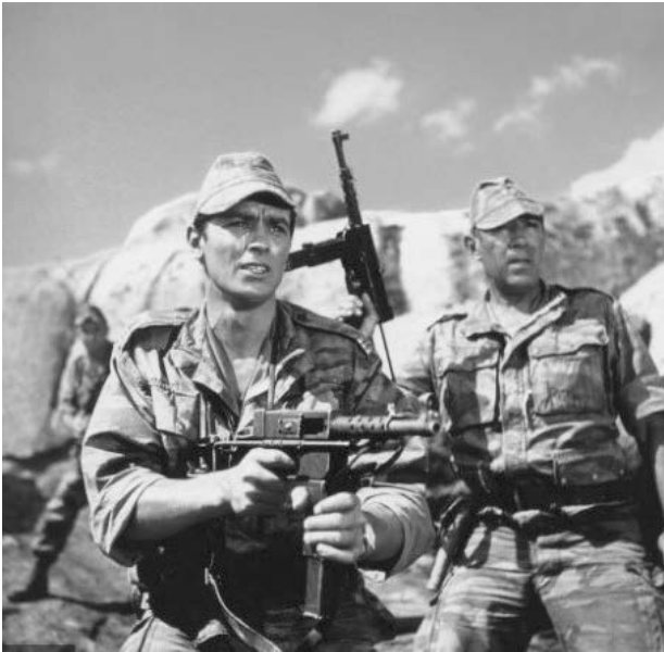
Fig. 5: Alain Delon and Anthony Quinn in Lost Command (1966, dir. Mark Ronson).

France, which his accent enhances; Delon contrasts with Quinn, but only to brighten his dominant spotlight.