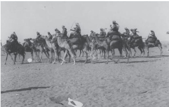
Fig. 6–8: Images of Camels related to Lawrence's operations, 1916–1918; Q 59073, Q 58861 and Q 59018.