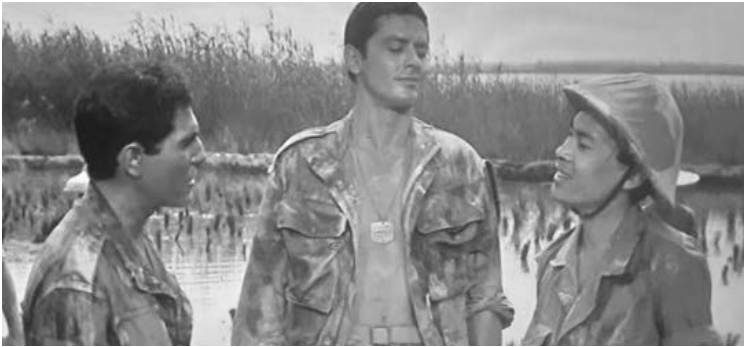
Fig. 2: Alain Delon in Lost Command (1966, dir. Mark Ronson).