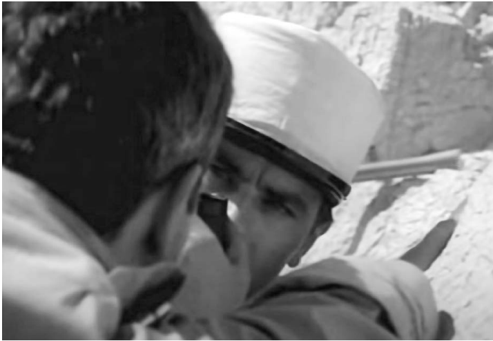
Fig. 3: Alain Delon in a Foreign Legion hat in L'Insoumis (1954, dir. Alain Cavalier).

from Luxembourg, a country foreign enough to be in the Legion but French enough to be played by a French icon. 25 Legionnaires fought most notably in the Franco-Algerian War as Paratroopers, the military group also most associated with the practice of torture. 26 Under this distinctive hat with his lower face obscured, the audience recognizes