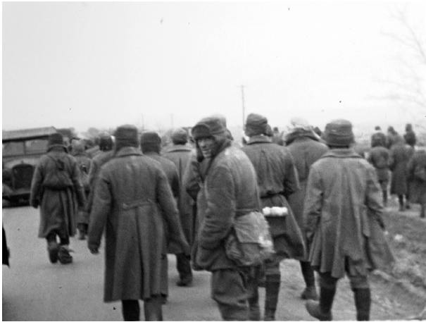
Fig. 3: Clemens von Wedemeyer, P.O.V. (2016), multiple video installation.

Army, or that with the local population in small Ukrainian villages. Only seldomly, unwillingly, does the frightened gaze of a prisoner or the gesture of a mother hiding herself and her children from the scrutiny of the camera reveal the film's very nature as an inscription of war from the point of view of the winner a futura memoria .