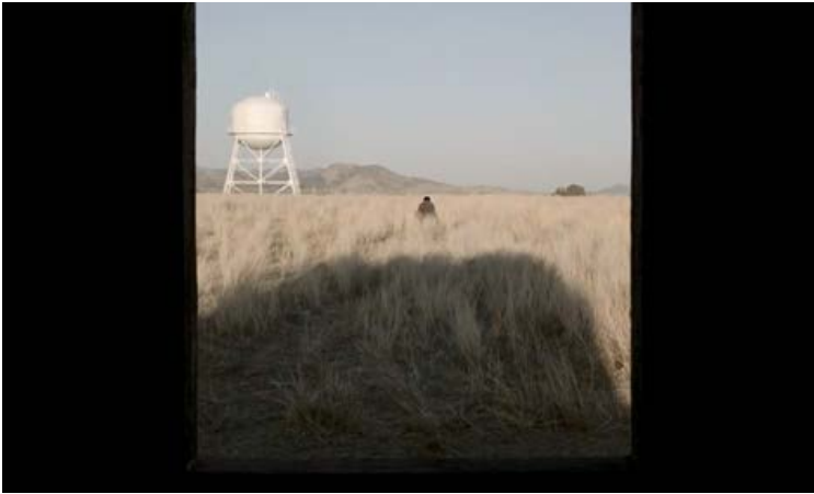
Fig. 4: Still from Heli : frame within a frame and violence from a distance.

trast of the building's interior creating a dark frame around the shot. Heli chases the man to the middle of the frame, tackles him, and begins to kick and hit him until his body stops resisting and lies still. The sound of the murder is barely audible over the diegetic sound of the TV program the man was listening to. Instead, we hear a presenter talk about how to make God hear our prayers. The words create a stark contrast with the actions of Heli, which reflect his taking justice into his own hands.