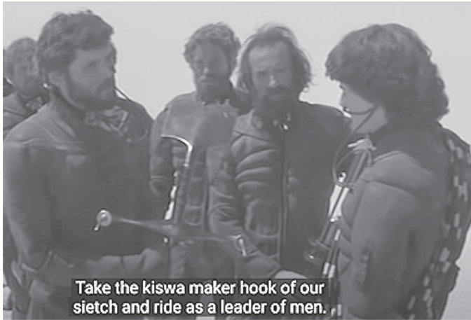
Fig. 4: Stilgar explaining how to ride the sandworm on Arrakis to Paul, Dune (1984).