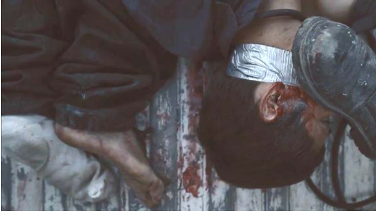
Fig. 1: Opening shot from Heli : feet, bound head, and boot in the bed of a truck.

Among the many similarities between these films, the presentation of both stories disturbs linear time: Heli to create a looming sense of peril, and Ya no estoy aquí to show a before and after in the protagonist's life. In both cases, the rupture of timelines gestures to the very essence of life under the necropolitical system. That is, the chaos, terror and monotony of living with the constant threat of violence and death. As both films illustrate, this is an unliveable scenario where conditions of precarity and insecurity reign supreme.