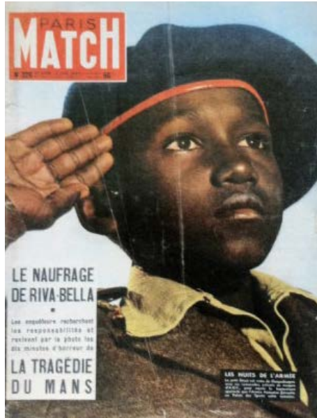
Fig. 1: Cover of Paris Match , June 26, 1965. The parade La Nuit des Armées is noted on the photo but is not referenced by Barthes.

in 1956/57, the year of the book's publication; not only had France lost Indochina and continued to wage war over ownership of Algeria, but the Rassemblement démocratique africain (RDA, African Democratic Assembly) had also been fueling movements in West Africa, where independence was imminent. The Match photo illustrates the political axis of the mainstream press in the thrall of censorship for any content about war in the French colonies and instead bolsters French patriotism. Barthes' commentary on the image's manipulation of its readers suggests the governmental and societal pressure to uphold a lie, though his blame in this essay is but implied. 7