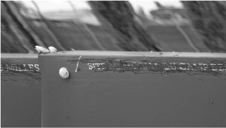
Fig. 2: Maya Schweizer, Der sterbende Soldat von Les Milles , 2014.

observed through the analytical lens of the camera that moves across space and yet never gives us a full sense of it.