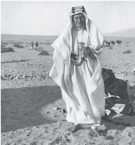
Fig. 3: T.E. Lawrence, n.d.; T.E. Lawrence Collection, Imperial War Museum, Q 59314.