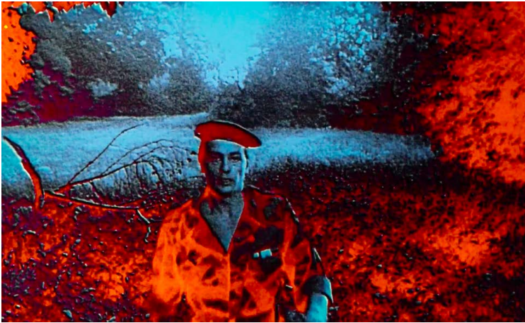
Fig. 7: The first of two flashbacks of Algeria in Diaboliquement vôtre (1967, dir. Julien Duvivier).

oticism's illusion and, in this last sentence, suggests an awareness of a strong resistance to colonialist ideology and representations.