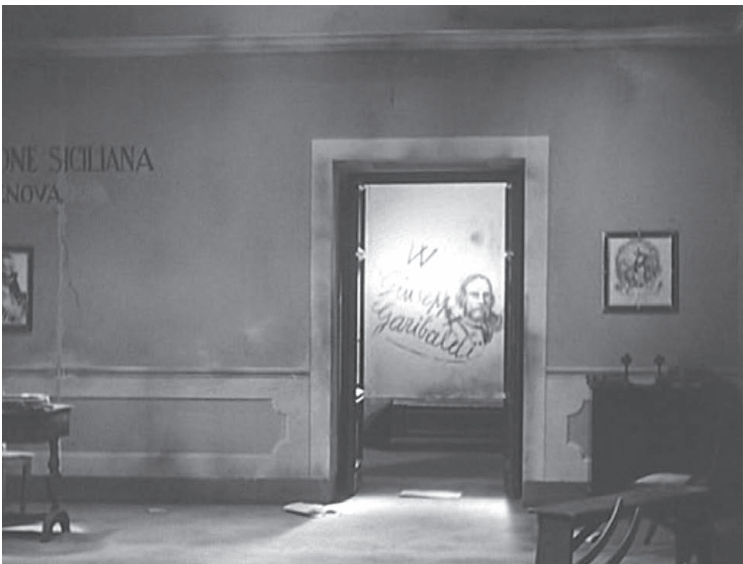
Figs. 7 and 8: Effigies of Garibaldi in Il grido dell'aquila and 1860 respectively.