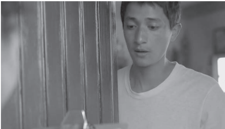
Figs. 2 and 3: Stills taken from Heli :