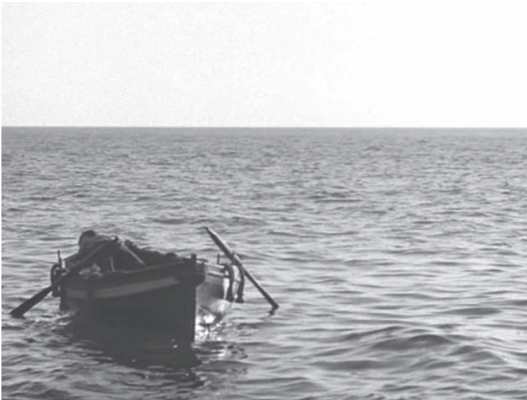
Figs. 5 and 6: Marching crowd in Il grido dell'aquila and an unconscious Carmeliddu in 1860.