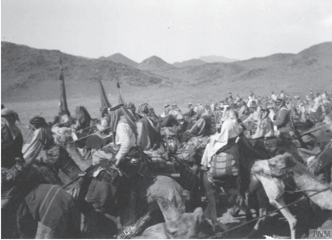
Fig. 10: Ageyl bodyguard, n.d., T.E. Lawrence Collection, Imperial War Museum, Q 58858B.

rial worlds both represent and the indigenous one the two men dive deep into. Lawrence's superiors also had no doubt at all that it was the part played by the British officers that was decisive for victory, an aspect that Herbert, consciously or unconsciously, also emphasized, as the Fremen only began to be successful in their military operations after Paul joined them.