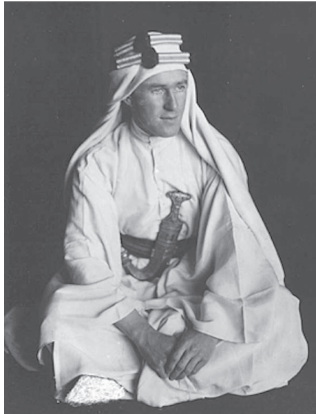
Fig. 1: T.E. Lawrence; T.E. Lawrence Collection, Imperial War Museum, Q 73535.

while the British officer coordinates the military actions of the indigenous people and in a way solely uses their potential in the name and for the sake of the British Empire, which Lawrence initially seems to have wanted to avoid so as to create an independent Middle East instead, Paul not only uses the Fremen locally but leads them straight into an intergalactic jihad. Other Western powers had tried to exploit the idea of a holy war of the Muslims against foreign rule before, but Lawrence acted rather pragmatically, and Feisal seemed politically experienced enough not to mix religion and politics. While Paul is also the center of a myth related to his military victories and his final