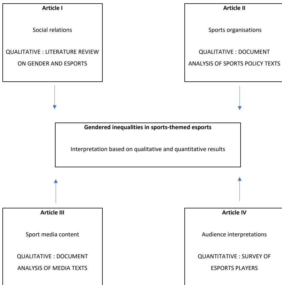
Figure 1. Research design of the thesis: Triangulation design