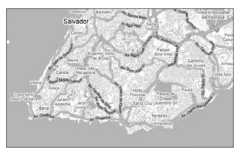
Fig. 2: Map over central parts of Salvador. Barra is situated on the tip of the peninsula.

Salvador da Bahia – the city of this research – is situated on the triangular peninsula at the entrance to Todos os Santos Bay, at the northeast coast of Brazil. Due to its location on the Atlantic coast, several Portuguese ships disembarked in the area in the 16<sup>th</sup> century. <sup>9</sup> In the centuries to come, the city served as the capital of the Portuguese colony and a vital link in the Portuguese empire. The extensive import of African slaves in the period between 16<sup>th</sup> and 19<sup>th</sup> century has made Salvador a historical and contemporary centre of Afro-Brazilian culture. Today, Brazil has the largest population of African descendants outside of Africa (Kenny 2007), with the highest concentration in Salvador where over 80 % of the population is defined as black or brown ( negra and parda ) in the latest Demographic Census (IBGE Census 2010).