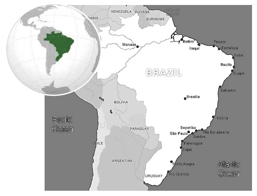
Fig. 1: Maps of Brazil