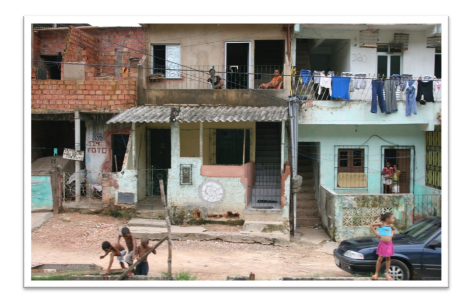
Fig. 4: Photo of favela housing, taken along the Subúrbio Ferroviário.

other is not very profitable, and higher-income consumers in general do not enter the favelas (Kenny 2007).