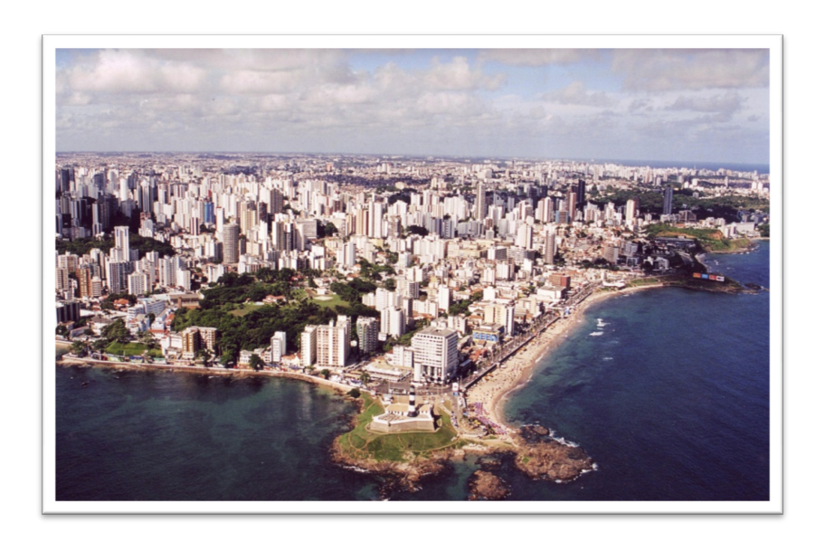
Fig. 3: Photo of Barra, showing the beaches, high-rises and the famous light-house in the front.

The way Caldeira portrays modern São Paulo bears many resemblances to the socio-spatial trends observed in Salvador. In middle and upper class neighbourhoods, such as Barra, the main site of this study, most residential buildings, hotels, shopping centres and fitness studios are enclosed spaces (see Ursin 2006).