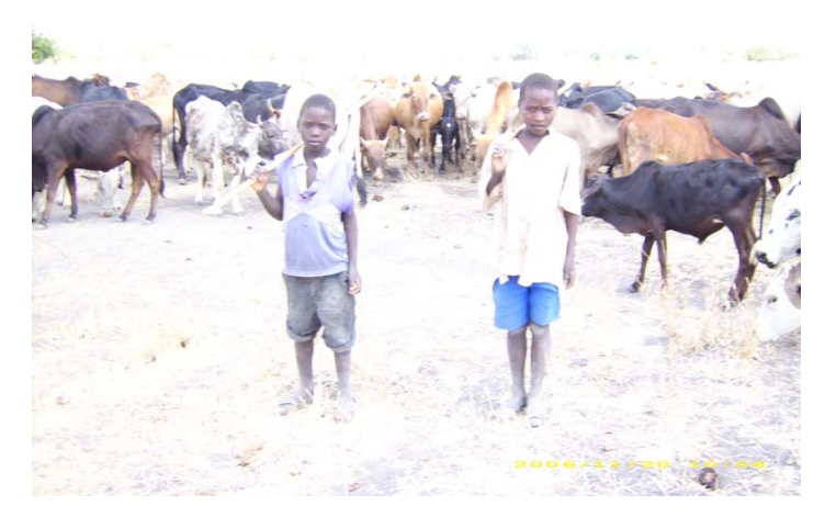
Source: Field data December 2006: Itigi Ward, Manyoni District- Singida (Photo: By G. J. M)

Boys aged between 10- 12 grazing in the wilderness a day long without attending school. It was common for children from agro- pastoralists' families to miss classes in order to look after cattle which affect their progress and performance leading to drop out of school.