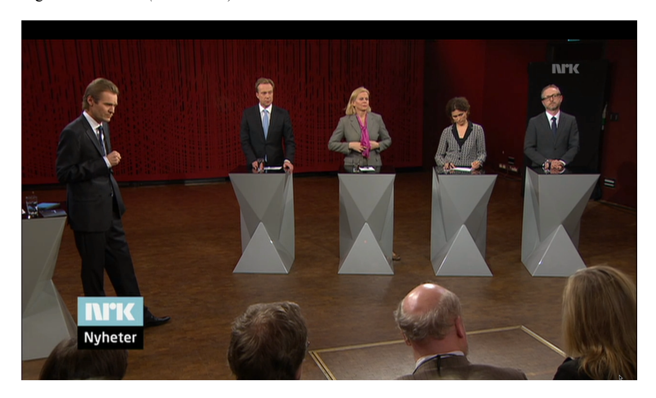
Figure 1. Debatten (The Debate)