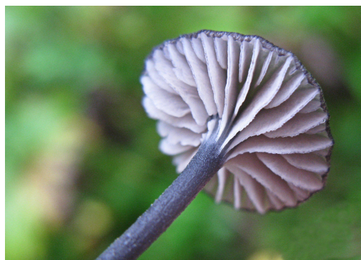
Figure 2. Lamellae of E. gomerense showing the serrulate, more or less blue edge of lamellae, collected 05.09.2011.