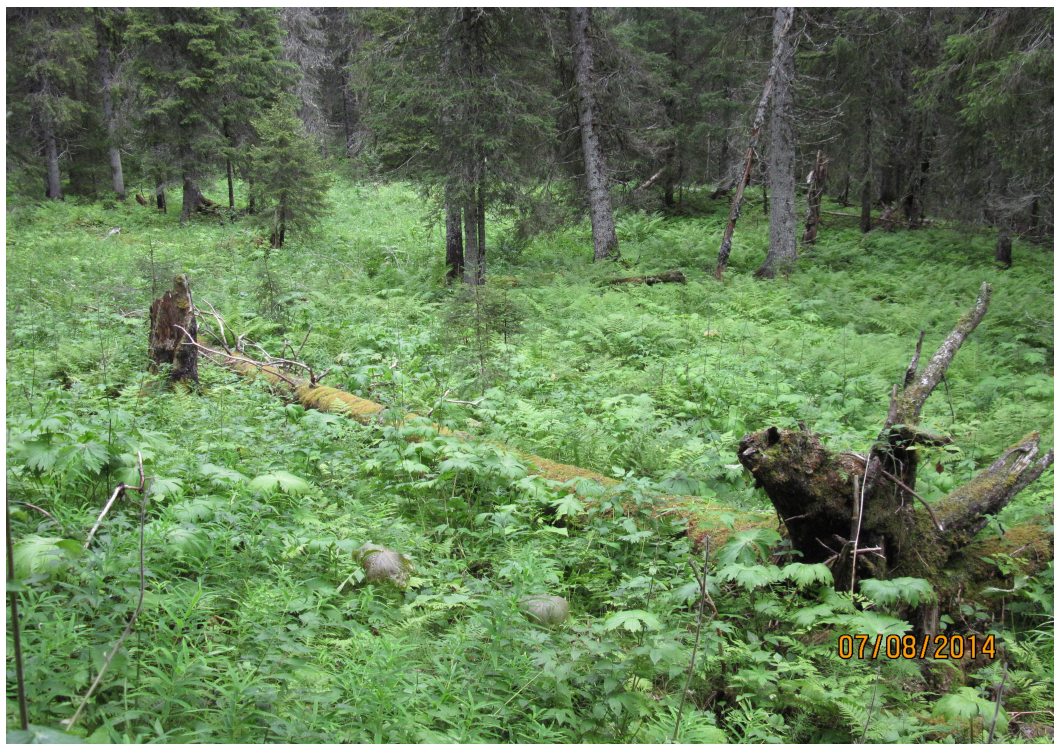
Figure 5. Habitat for E. gomerense with Aconitum lycoctonum ssp. septentrionale , in old calcerous spruce forest. The fern Athyrium filix-femina is displacing Aconitum lycoctonum ssp. septentrionale , which now is about to be decimated due to trampling.

Secondly, the species of trees and vegetation are a very diverge factor. Deciduous forest dominates all described habitats except those of Holmvassdalen, where old spruce forest is typical, mixed with a few birches. The vegetation of vascular plants on the locations is not described for finds outside Holmvassdalen. In this area the habitats of E. gomerense are