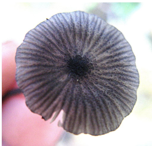
Figure 1. Entoloma gomerense showing typical black and bluish color of pileus, collected 13.09.2008.

varying from broadly clavate to cylindrical and lageniform.