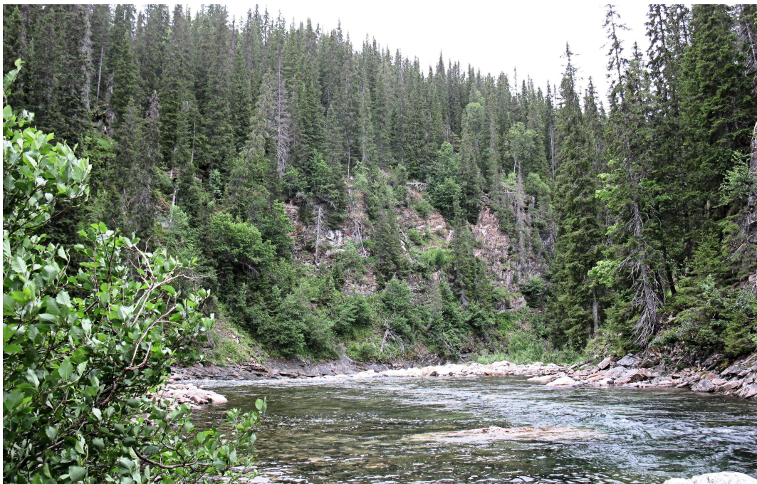
Figure 4. The river in Holmvassdalen flows partly in a canyonlike valley, keeping moisture in the air constantly high.

According to Noordeloos, E. gomerense generally prefers moist places with mosses and peaty soil (Noordeloos 2012). It was originally described from a few localities on the island La Gomera, of the Canary Islands, found in roadside in evergreen Laurel forest,