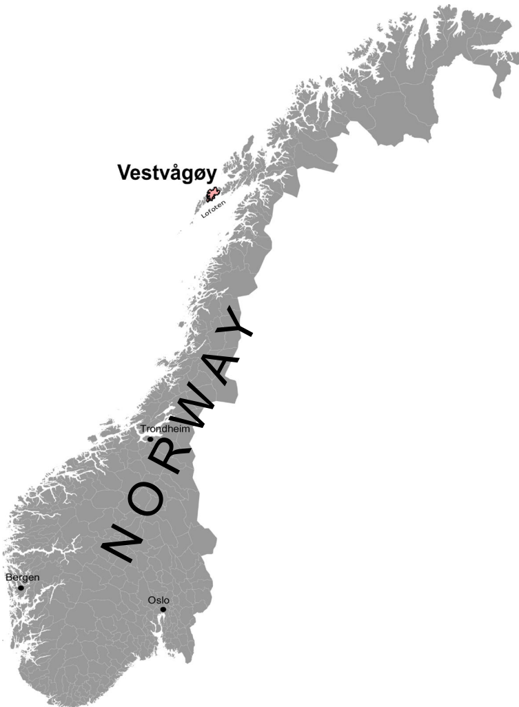
Fig. 2 The case study site, Vestvågøy municipality, Nordland County, Norway

climate projections and local observations of weather changes we would expect the inhabitants to worry about the impacts of climate change (Kvalvik et al. 2011; Hovelsrud et al. 2010).