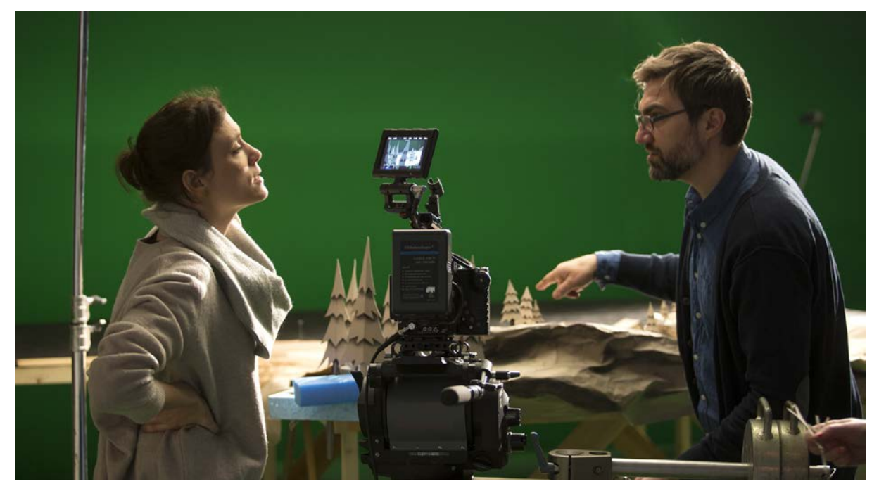
Figure 3: The Director and the Art Director on set of the production of "Wanda".

I have been observing a lot as an intern, especially in the beginning of the period. To get the opportunity to look over the shoulder of their producer have been very strengthening for me, as I, for instance, could listen to their discussions about how the commercials should be to convey the message.