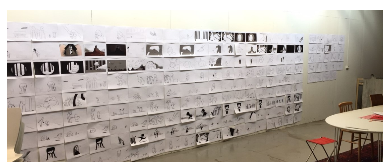
Figure 11: The storyboard for "Wanda" nailed to the wall in the studio.

For me as a producer, it was a great experience to spend part of my production period as an intern. I got good insight in how companies in the business operate, and I got to know people and expand my network. With external contributors like the director for the short film, I got to know even more people. I have learned a lot about how to think about budgets and providing money to a production, what a producer should prioritize in a production, and I have learned about some small factors that can sway the production in the right direction. This period was a vital part of my production, and I am very happy I got the opportunity to be a part of it.