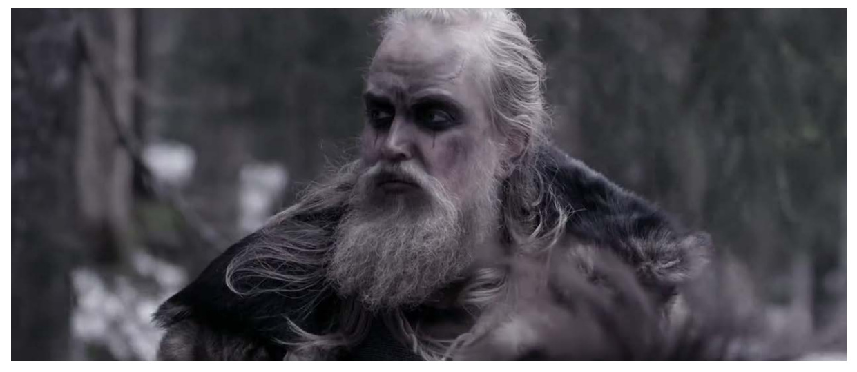
Figure 8: Footage from the trailer for Korsvikaspillet.

The other commercial was a film trailer for a local play, called Korsvikaspillet. During the preproduction, I was a part of storyboarding, scheduling and planning, and I was observing some of the casting. It was a quite small project, with only one director and one cinematographer, and I was one of three assistants. Because we were so few in the crew, it meant it was a lot for the assistants to do. I just had to help wherever needed, which included some camera assisting, preparing gear and helping the cast.