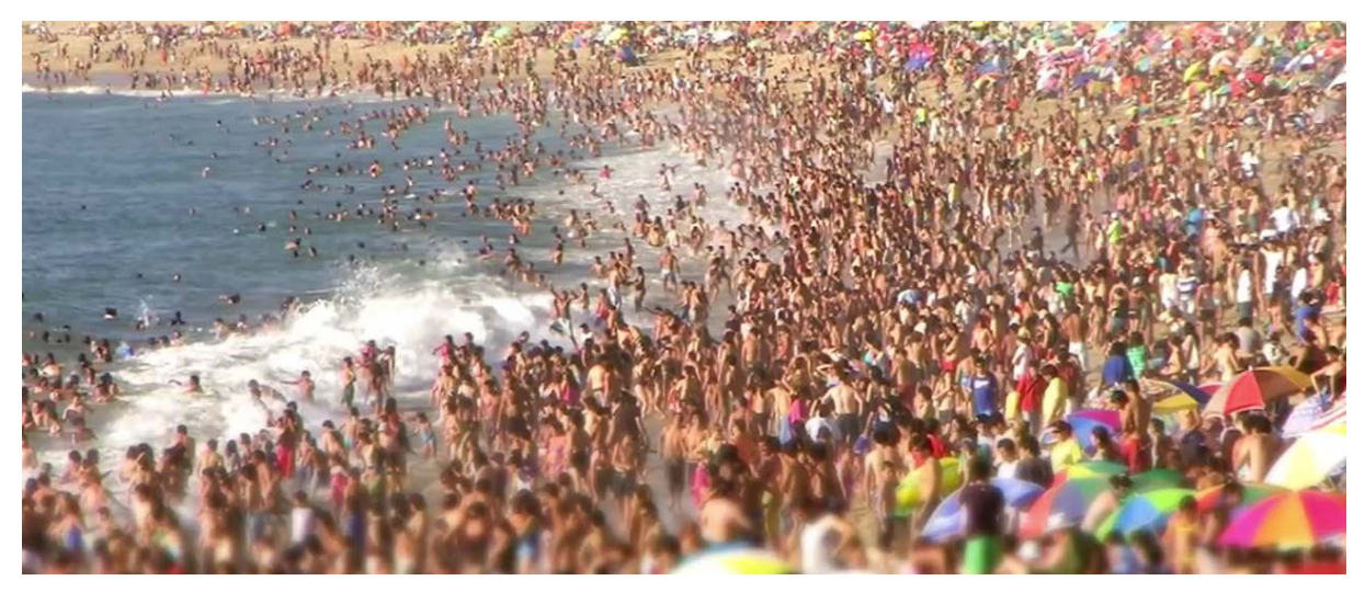
Figure 6: Stock footage of overcrowded beach for commercial.

It was also educational for me to be a part of the commercials we made during my time at Klipp Og Lim. For one of them, I was heavily involved with the research and buying of stock footage. It was a commercial for a travelling agency, and the idea of the commercial was to put contrast of stress and overcrowded masses in opposition to a couple with a lot of space and time to relax and do fun activities.