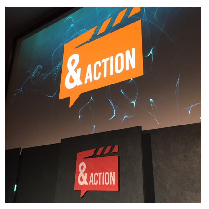
Figure 9: Top of the panel with logo and big screen at the main auditorium at &Action.

During my time as an event producer, I had many administrative tasks. Aside from them, I wanted to contribute in any way I could, and for instance, on the creative side, we worked with a panel for the main auditorium. The panel idea, whom Jonathan Paul Green designed, was built and completed by our team, and put up in the main auditorium. We wanted to set a scene in the auditorium, and not just let it look like an auditorium at a school. Putting together, painting and setting up the panel was a good addition to the administrative work I mostly dealt with.