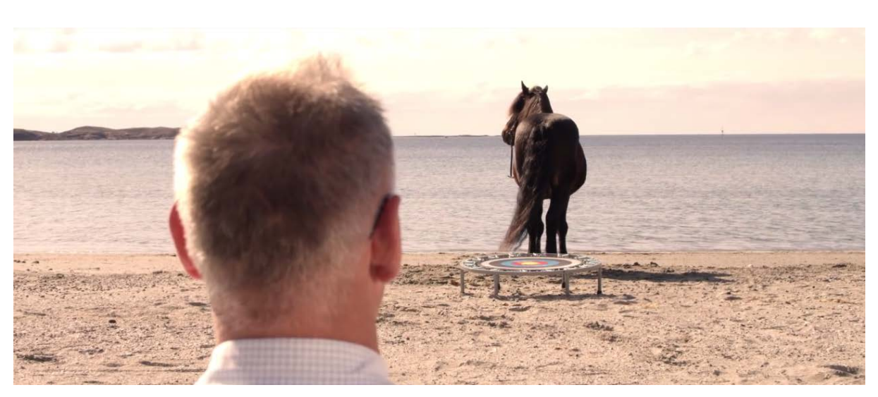
Figure 7: Footage from commercial for Opplev Trøndelag.

The commercial can be viewed at: <u>https://www.youtube.com/watch?v=cvl5qpZkwoE</u>