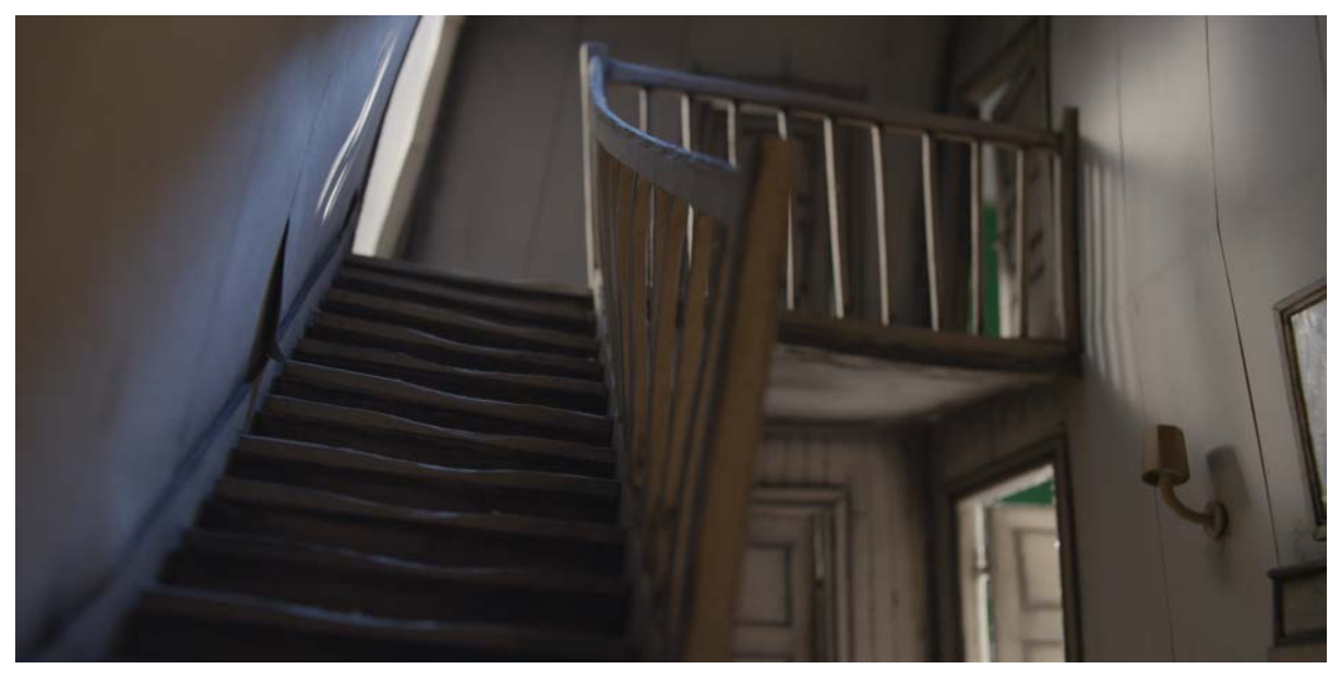
Figure 5: A closer look of one of the sets from "Wanda".

It was also educational for me to be a part of the commercials we made during my time at Klipp Og Lim. For one of them, I was heavily involved with the research and buying of stock footage. It was a commercial for a travelling agency, and the idea of the commercial was to put contrast of stress and overcrowded masses in opposition to a couple with a lot of space and time to relax and do fun activities.