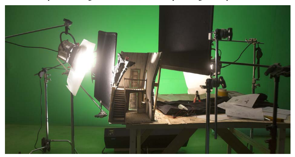
Figure 4: The set and surroundings during the shoot of "Wanda".

The short film project we did was probably the most educational for me. It was great to get insight in how films are shot, or at least how they would shoot a film. Even though it was a company made short film, external director, cinematographer and lighting was assigned to the project. During the project, I was mostly doing scripting during the shoot, and I had some camera assisting duties. I was also helping with setting up the lights, and it was very educational to learn about the lighting department, which I did not know very much about before. To tie it to the producer, it is very important for a producer to get to know the other roles in a production to exploit them the best way possible. Because the production was relatively small, I got to know each of the roles even better. It was a different kind of production, because almost all shots were still shots with no movement on pre-made sets, because the characters was going to be made on top of the footages. Nonetheless, it was very exciting to be a part of.