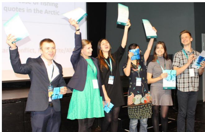
The winning group receive diplomas and applause.