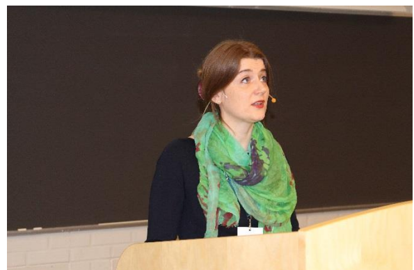
Grete Ellingsen, State Secretary, Ministry of Local Government and Modernization.

The opening line from Grete Ellingsen , State Secretary (Ministry of Local Government and Modernization, Norway), was that the Arctic Ocean is like a treasure box of resources and possibilities. There is a need to use the ocean's treasures in a sustainable way through international cooperation. Norway is an Arctic country, more sea than land, and 80% of its seas are located north of the Arctic Circle. The Arctic Ocean and its resources are very important for Norwegian economic development. Thus the aim of future development is to be among the most creative and sustainable regions in the world. The questions about climate change, emissions and population growth are of great importance to Norway.