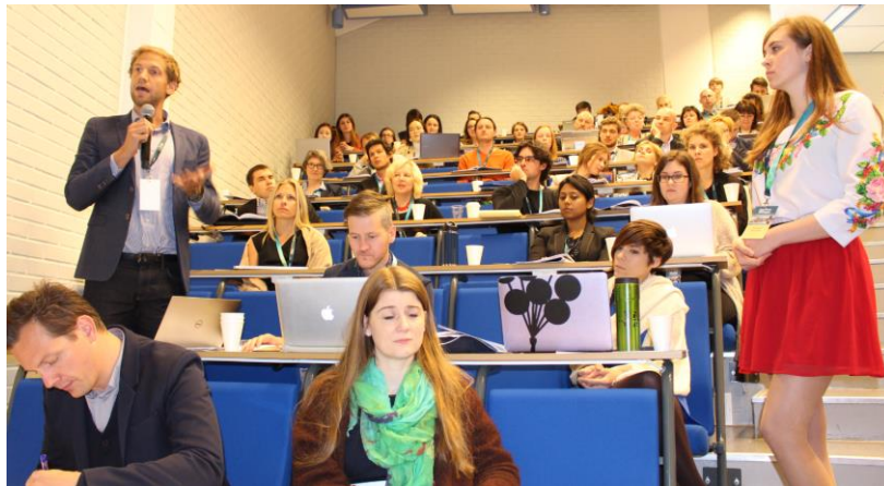
Q&A during one of sessions.

had increased several times – to 1,000,000 MT. The amount of production has further dramatically increased in recent years. There is greater utilization of new technologies; sea farmers use lasers, sound, shielding, offshore bases, etc. An important element is also ocean forest and fish farming; farmers are able to create natural conditions for fish. The “Blue Future of the Arctic” refers to the marine world; there should be more emphasis on and investments in this.