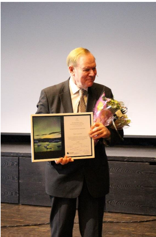
Paavo Lipponen accepting the first ever High North Hero Award.