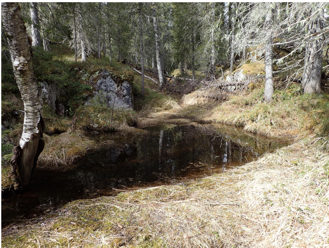
Figure 2. Habitat of Psathyrella jacobssonii in Holmvassdalen.

varies from distinct to faint. The drops and reaction disappear gradually when the basidiomata are dried and fail to come by old herbarium material. The newly described Psathyrella conferta Eyssart. & Chiaffi from France also belongs to the group (Eyssartier 2004) and from America and Japan further six species are known (Hoashi 2008). The gill edge of P. fusca is covered with drops, but these drops are remaining colourless in a solution of ammonia.