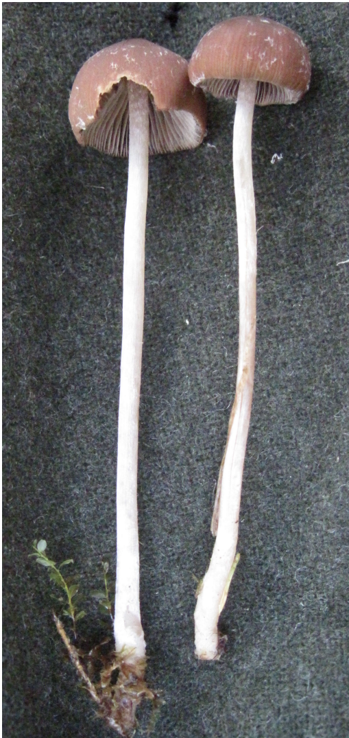
Figure 3. Two specimens of Psathyrella jacobssonii from Holmvassdalen.

sis, however, demonstrated they had identical sequences in the ITS region. This shows that it sometimes can be difficult with certainty to identify P. jacobssonii morphologically, and that molecular assistance is necessary for a safe identification.