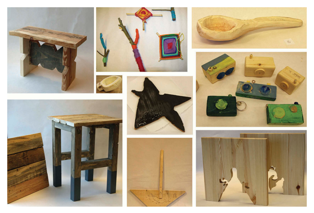
Photo collage 4. Primary school children's artefacts made of wood (also some textile and pieces of metal).