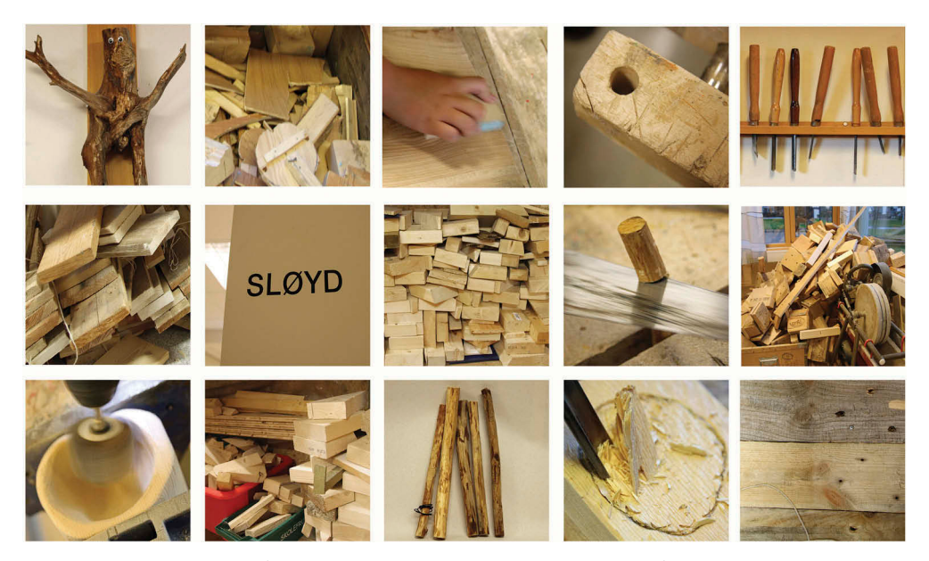
Photo collage 1. Agency of Wood - Materials, rooms and tools with affordances inviting to action.

Johnstone, 2009). It is through the embodied, sensory meetings with materials that I seek to understand the teachers' practice theories (see Kemmis et al., 2014) and produce rich interviews and discussions. Based on a broad understanding of how learning is embodied and material, embodied engagement activating the senses in this study is seen as primary, not secondary, in the teachers' and researcher's meaning-making processes.