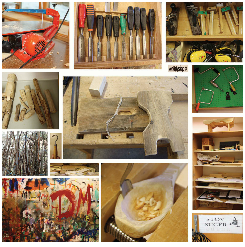
Photo collage 2. Woodworking rooms with agency - examples of the variety of photographic empirical material.

In six of the eight schools I had the possibility to observe children (from age 6 to 12) working in class, and in all the schools I performed multisensory interviews with the teachers. The school visits varied in length, from two hours to a whole working day for the teacher. These school visits can best be described as sensory explosions. The sound of hammers, saws and drills in action at times was so deafening that ordinary speech was out of the question. The fine layer of wood dust sometimes hindered the writing of my observation notes. Despite the short time span of the school visits, the sensory traces they have left on/in me have been rich and important when it comes to giving me an experience of the different characteristics and qualities at work in the different schools. As a result, the empirical material produced consists of a variety of expressions; 1074 photos, 8 research journals, 181 minutes of video material, 6 observation logs, 640 minutes of audio material and 182 survey responses (the survey is mentioned here only for contextualization; see Maapalo, 2017 for analysis of the survey).