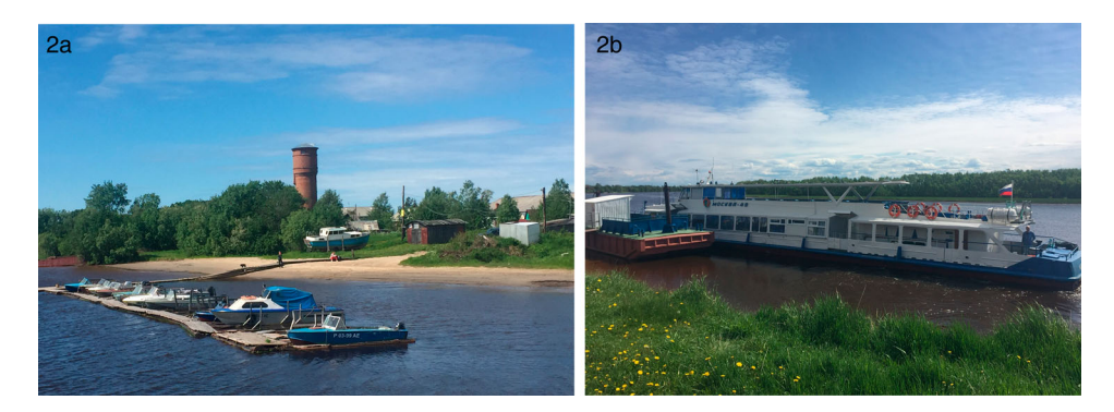
Figure 2. Private boats (2a) and a passenger vessel (2b). Both photos are taken near the village of Vozne-senie.

Trips on intercity and suburban shipping lines usually take between 20 minutes (to the nearest settlement) and a couple of hours. While passenger vessels present a reliable form of local mobility, there are occasionally cancellations due to bad weather conditions (e.g. News29.ru, 2019). Moreover, due to the declining island population, the number of