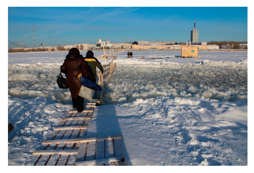
Figure 3. A temporary bridge is used by island residents to cross a shipping corridor over the North Dvina River on their way to Arkhangelsk.

crossed by caravans , a convoy of vessels led by an icebreaker navigating ice-bound waters. In those situations, residents wait outside for the construction of a small bridge over the gap (a shipping corridor) in the ice while the river freezes up, allowing them to cross (A11). When a new convoy is expected, the bridges are removed by caretakers (Figure 3).