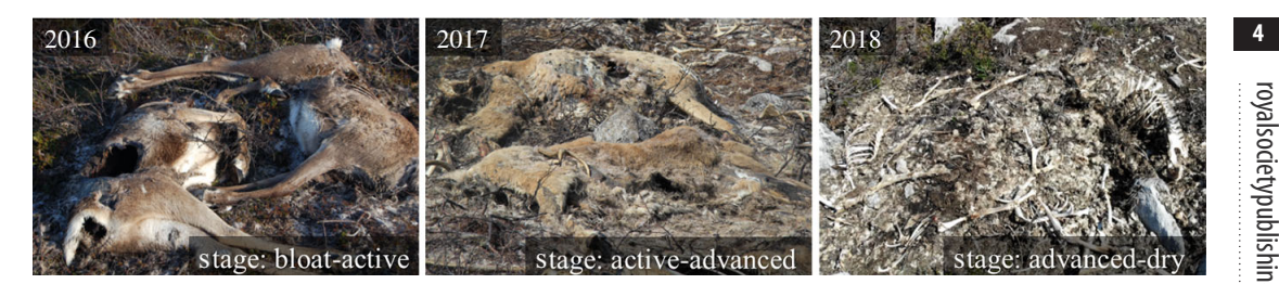
Figure 2. Carcass decomposition staging is depicted annually from 2016, when the mass die-off occurred on 26 August, until 2018. All pictures are from the autumn season and are staged according to a typical classification scheme provided by Barton & Bump [35]: 'fresh'—lasts only a few minutes; 'bloat'—describes the release of bacteria into gut, lymphatic and other tissues of the body along with the by-product of gases; 'active' decay—the putrefaction and liquefaction of carcass tissues, and the release of volatile organic compounds; 'advanced' decay—the final breakdown of soft tissues and the appearance of the skeleton; and 'dry' decay—occurs over a longer period, and can vary depending on the environment, but it refers to persistence of the ligaments, nails, hair and skeleton, whereas other carcass parts are absent. There was variability in the staging of carcasses on the study site, and most varied between two stages within a year (see 'stage' in images).