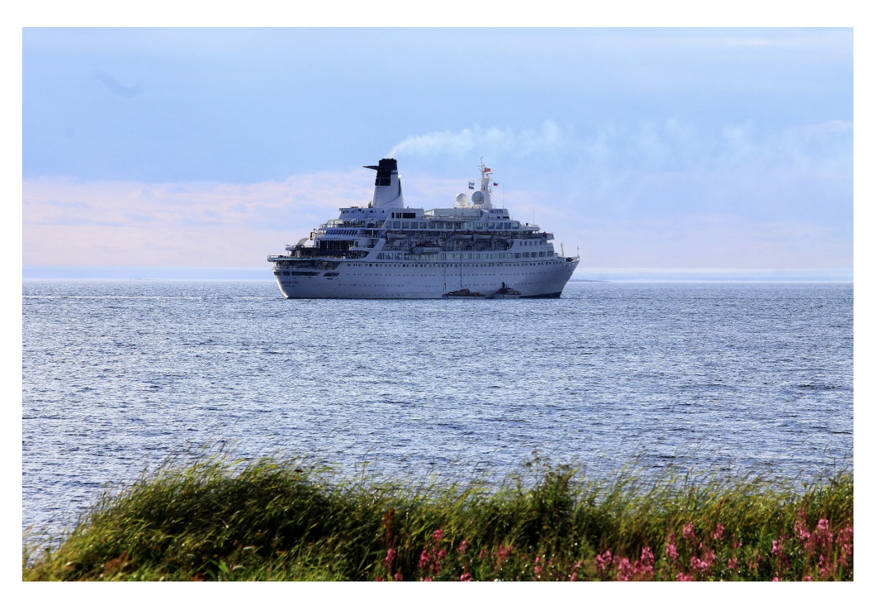
Fig. 17.3 The cruise vessel Discovery anchors near the Solovetsky archipelago.