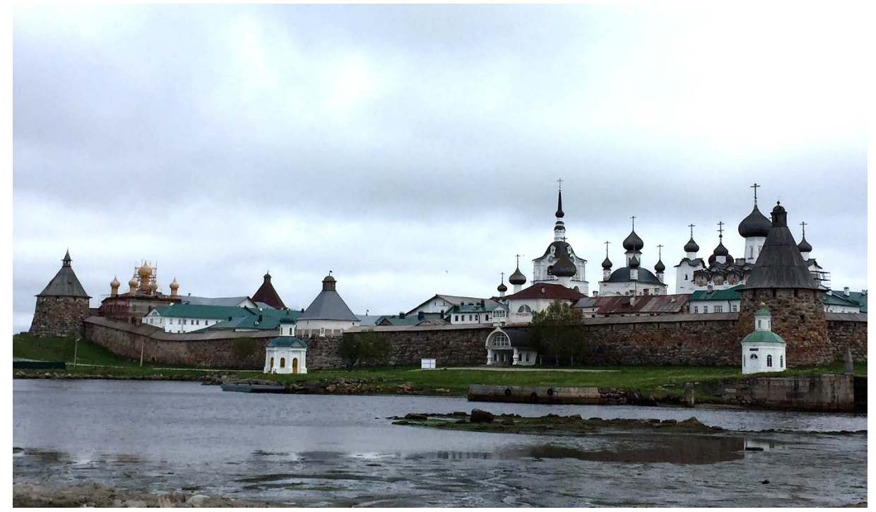
Fig. 17.2 The Solovetsky Monastery, the main attraction of the Solovetsky archipelago.