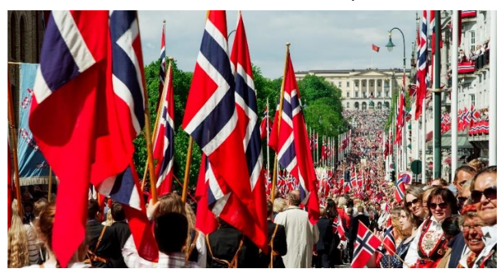
Fig. 2. Present-day celebration of May 17th in Oslo<sup>10</sup>.

17th has become an important marker for Norwegian national identity and has also been used in tourism promotions, it often seems to lose touch with history.