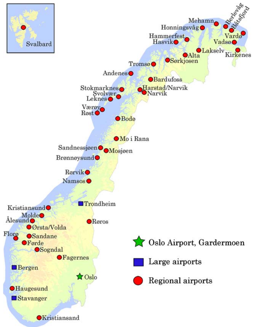
Fig. 1 Airports in Norway owned by Avinor

The regional airports had, according to Avinor, an average deficit amounting to about NOK 15.5 million in 2009. In 2006 the Civil Aviation Authority (CAA) issued directives for Norwegian airports aimed at preventing and reducing the extent of accidents in the aviation industry. These regulations (BSL E 3-2) were adopted for regional airports by The Norwegian Ministry of Transport and Communication (MTC) [16]. Avinor estimates that the total investment cost for the regional airports of meeting the new requirements amounts to NOK 1.7 billion.