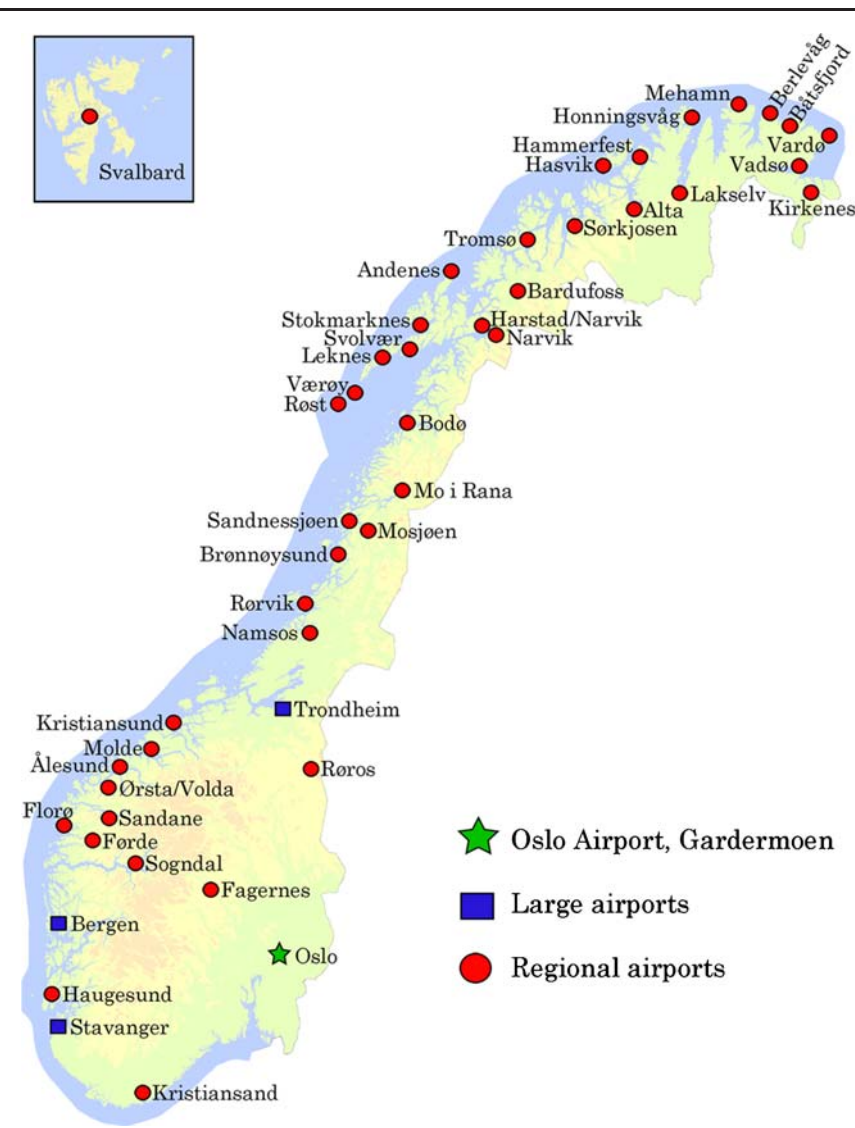
Fig. 1 Airports in Norway owned by Avinor

The regional airports had, according to Avinor, an average deficit amounting to about NOK 15.5 million in 2009. In 2006 the Civil Aviation Authority (CAA) issued directives for Norwegian airports aimed at preventing and reducing the extent of accidents in the aviation industry. These regulations (BSL E 3-2) were adopted for regional airports by The Norwegian Ministry of Transport and Communication (MTC) [16]. Avinor estimates that the total investment cost for the regional airports of meeting the new requirements amounts to NOK 1.7 billion.