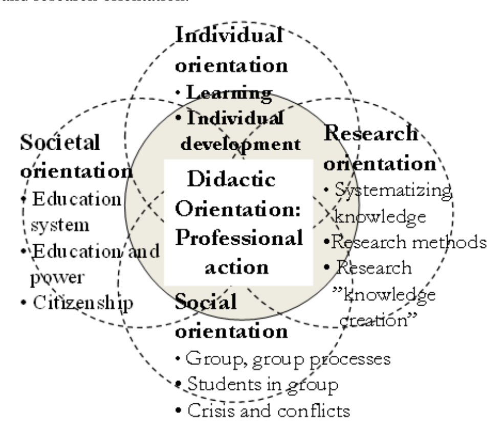
Figure 2 General didactics as an arena for knowledge creation

Figure 2 shows how the outlines for the content of general didactics can be categorized into the following five orientations: societal, individual, social, didactic and research orientation.