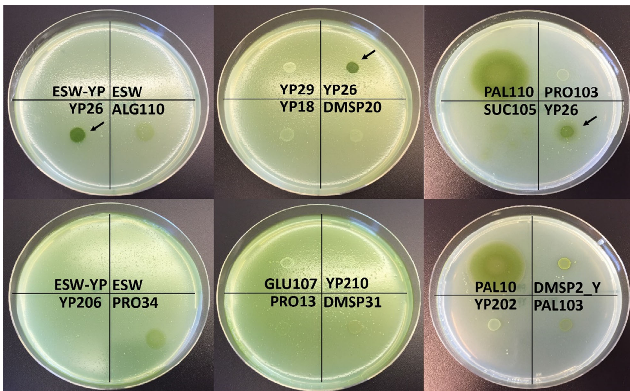
Fig. 2. Co-cultivation of Nannochloropsis sp. CCAP211/78 and bacterial strains on double-layer agar plates after seven days. ESW (Enriched natural seawater medium) and ESW-YP (ESW medium with peptone and yeast extract) were used as controls. The labelled names referred to the added bacteria. YP26 was added on three different plates as replicates indicated by arrows.

agarases (Lee and Choi, 2017), and the enzymatic hydrolysis of agar yields monomeric sugars, such as D-galactose, 3,6-anhydro-L-galactose and L-galactose-6-sulphate (Chi et al. , 2012). Research has shown that supplementation with galactose increases the growth rate of Nannochloropsis salina by nearly 10% (Velu et al. , 2015).