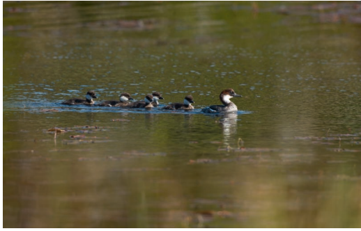
Figure 3. One of the Smew Mergellus albellus broods recorded in Vikna during surveys in late June (Photo: Kjartan Trana).

Et av salskrake Mergellus albellus kullene som ble registret i Vikna under kartleggingene i slutten av juni (Photo: Kjartan Trana).