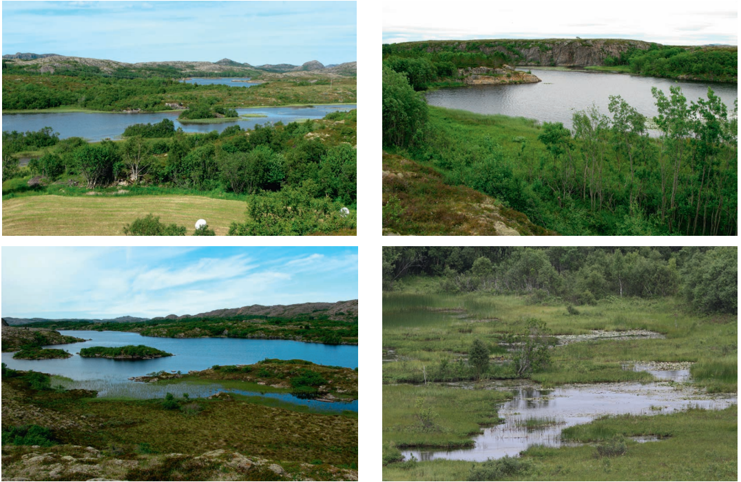
Figure 2. Examples of typical Smew Mergellus albellus breeding habitats on the coastal islands in Vikna municipality in Central Norway.

Eksempler på typiske hekkehabitat for Salskrake Mergellus albellus på kystøyer i Vikna kommune i Midt-Norge.