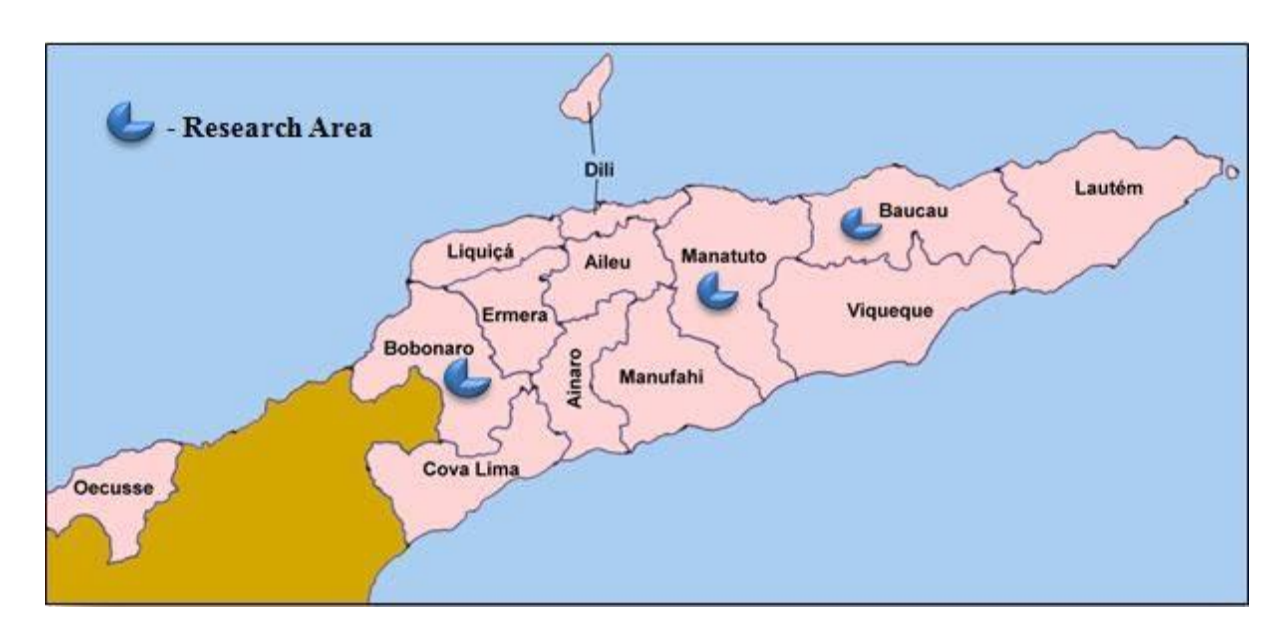
Appendix 2 – Research Area in Timor-Leste