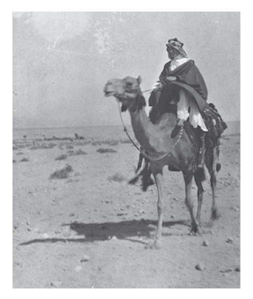
Fig. 5: Lawrence on a Camel, Akaba, n.d.; T.E. Lawrence Collection, Imperial War Museum, Q 60212.