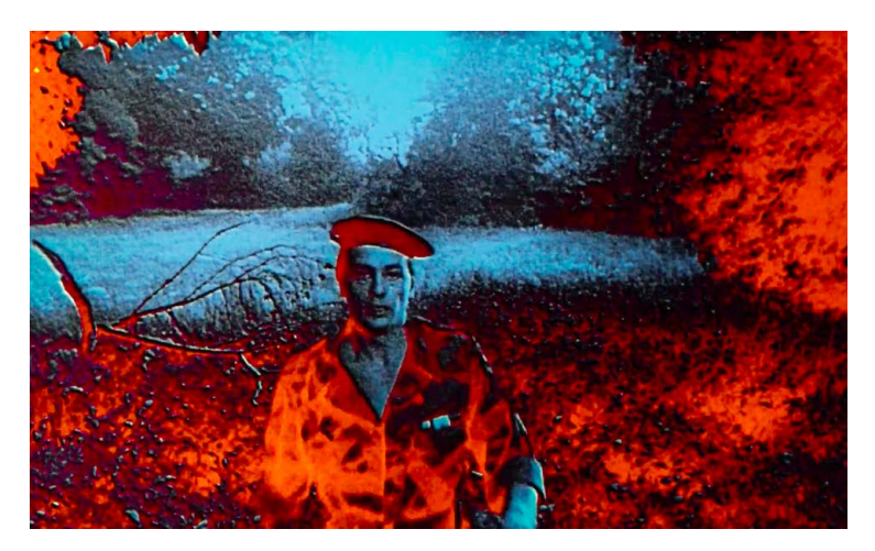
Fig. 7: The first of two flashbacks of Algeria in Diaboliquement vôtre (1967, dir. Julien Duvivier).

oticism's illusion and, in this last sentence, suggests an awareness of a strong resistance to colonialist ideology and representations.