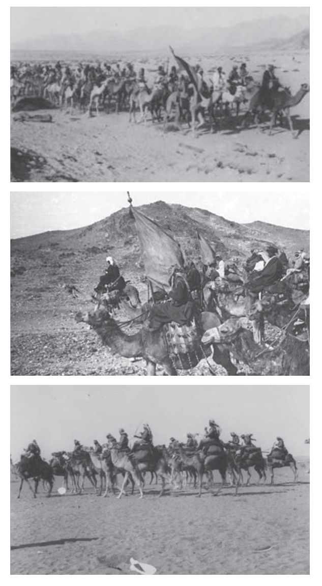
Fig. 6–8: Images of Camels related to Lawrence's operations, 1916–1918; Q 59073, Q 58861 and Q 59018.