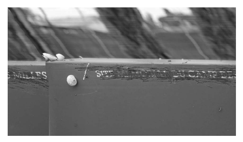
Fig. 2: Maya Schweizer, Der sterbende Soldat von Les Milles, 2014.

observed through the analytical lens of the camera that moves across space and yet never gives us a full sense of it.