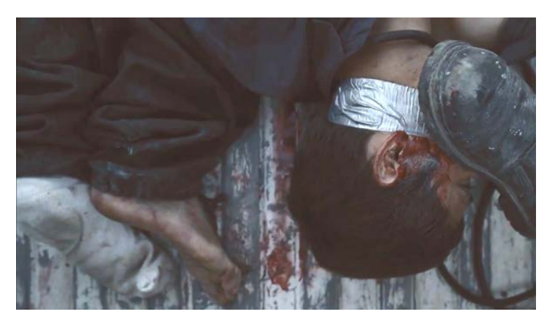
Fig. 1: Opening shot from Heli : feet, bound head, and boot in the bed of a truck.

Among the many similarities between these films, the presentation of both stories disturbs linear time: Heli to create a looming sense of peril, and Ya no estoy aquí to show a before and after in the protagonist's life. In both cases, the rupture of timelines gestures to the very essence of life under the necropolitical system. That is, the chaos, terror and monotony of living with the constant threat of violence and death. As both films illustrate, this is an unliveable scenario where conditions of precarity and insecurity reign supreme.