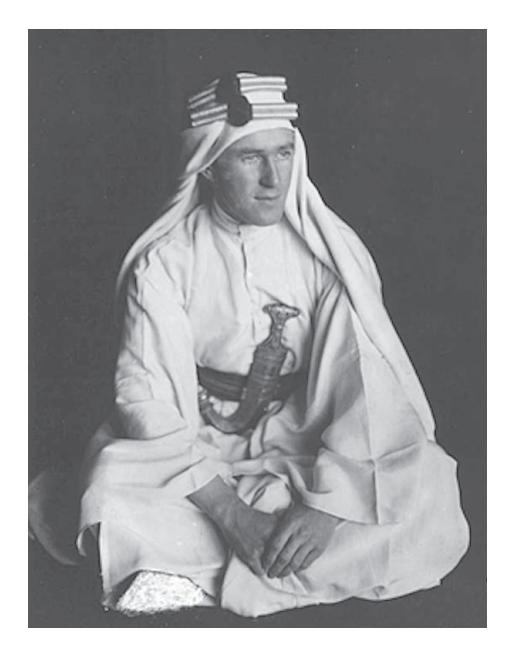
Fig. 1: T.E. Lawrence; T.E. Lawrence Collection, Imperial War Museum, Q 73535.

while the British officer coordinates the military actions of the indigenous people and in a way solely uses their potential in the name and for the sake of the British Empire, which Lawrence initially seems to have wanted to avoid so as to create an independent Middle East instead, Paul not only uses the Fremen locally but leads them straight into an intergalactic jihad. Other Western powers had tried to exploit the idea of a holy war of the Muslims against foreign rule before, but Lawrence acted rather pragmatically, and Feisal seemed politically experienced enough not to mix religion and politics. While Paul is also the center of a myth related to his military victories and his final