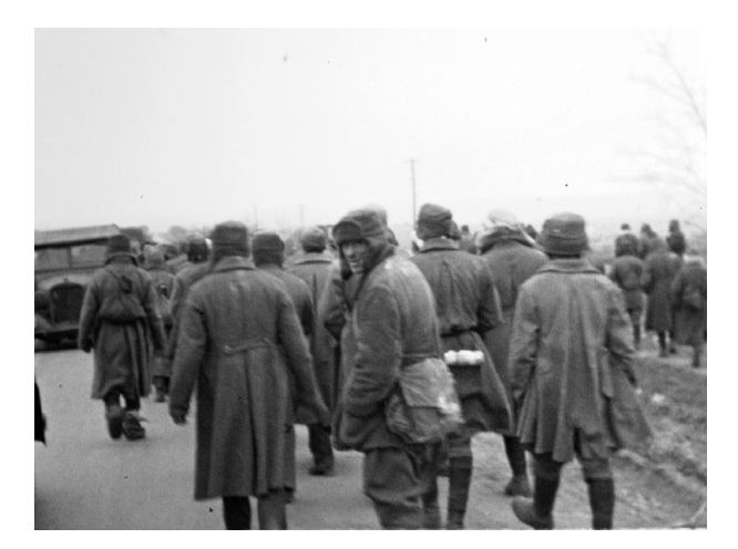
Fig. 3: Clemens von Wedemeyer, P.O.V. (2016), multiple video installation.

Army, or that with the local population in small Ukrainian villages. Only seldomly, unwillingly, does the frightened gaze of a prisoner or the gesture of a mother hiding herself and her children from the scrutiny of the camera reveal the film's very nature as an inscription of war from the point of view of the winner a futura memoria .