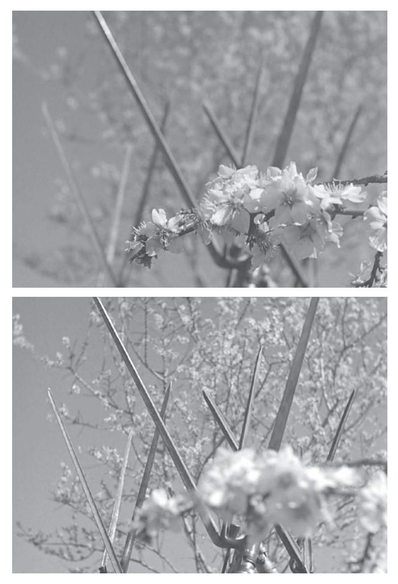
Figs. 3 and 4: Different focus in the same shot.