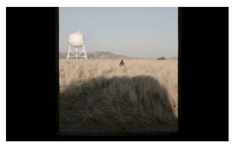
Fig. 4: Still from Heli : frame within a frame and violence from a distance.

trast of the building's interior creating a dark frame around the shot. Heli chases the man to the middle of the frame, tackles him, and begins to kick and hit him until his body stops resisting and lies still. The sound of the murder is barely audible over the diegetic sound of the TV program the man was listening to. Instead, we hear a presenter talk about how to make God hear our prayers. The words create a stark contrast with the actions of Heli, which reflect his taking justice into his own hands.