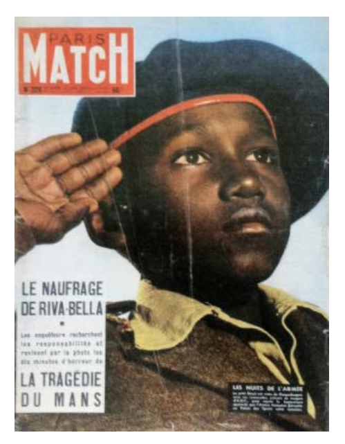
Fig. 1: Cover of Paris Match , June 26, 1965. The parade La Nuit des Armées is noted on the photo but is not referenced by Barthes.

in 1956/57, the year of the book's publication; not only had France lost Indochina and continued to wage war over ownership of Algeria, but the Rassemblement démocratique africain (RDA, African Democratic Assembly) had also been fueling movements in West Africa, where independence was imminent. The Match photo illustrates the political axis of the mainstream press in the thrall of censorship for any content about war in the French colonies and instead bolsters French patriotism. Barthes' commentary on the image's manipulation of its readers suggests the governmental and societal pressure to uphold a lie, though his blame in this essay is but implied.<sup>7</sup>