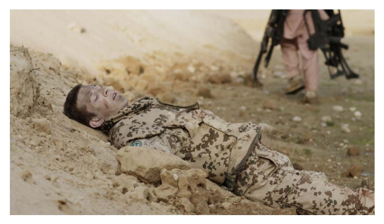
Fig. 1: Omer Fast, Continuity, 2012. Film still.

Avail Themselves (The Disasters of War, 1810–1820) is a contemporary version of the history painting. Susan Sontag sees in the staging of this scene—where the mutilated, bloody bodies of Russian soldiers are represented as they laugh and chat—the ability to depict reality more precisely.