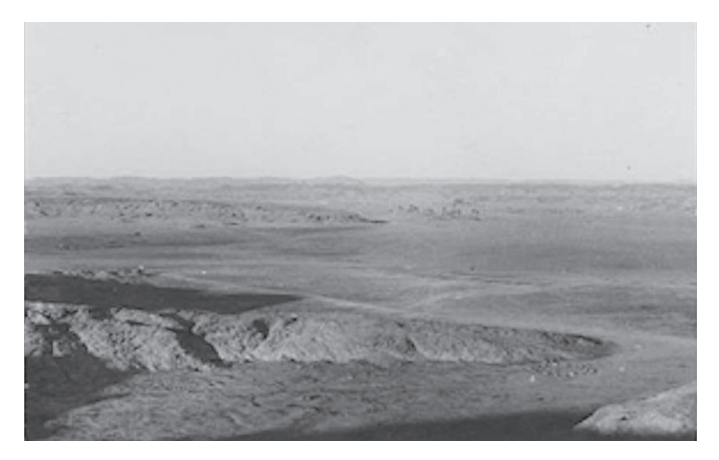
Fig. 2: View of the desert near Wejh; T.E. Lawrence Collection, Imperial War Museum, Q 59014.