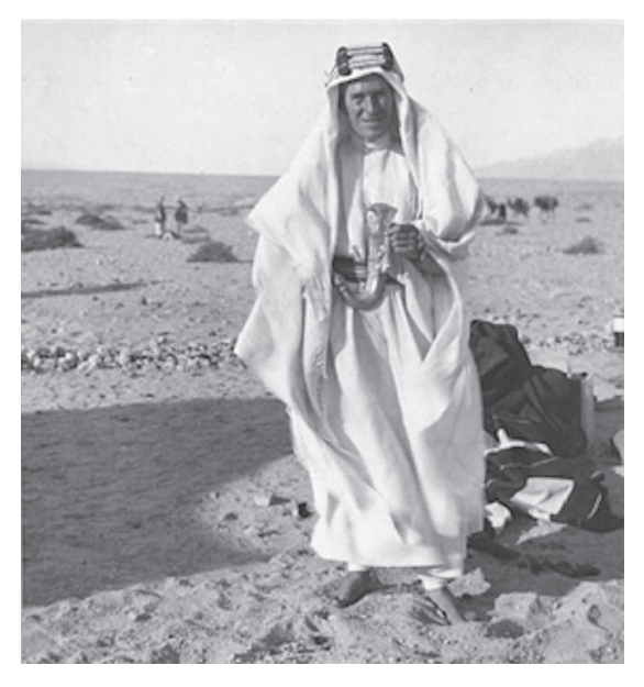
Fig. 3: T.E. Lawrence, n.d..