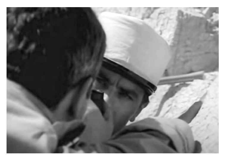
Fig. 3: Alain Delon in a Foreign Legion hat in L'Insoumis (1954, dir. Alain Cavalier).

from Luxembourg, a country foreign enough to be in the Legion but French enough to be played by a French icon.<sup>25</sup> Legionnaires fought most notably in the Franco-Algerian War as Paratroopers, the military group also most associated with the practice of torture.<sup>26</sup> Under this distinctive hat with his lower face obscured, the audience recognizes