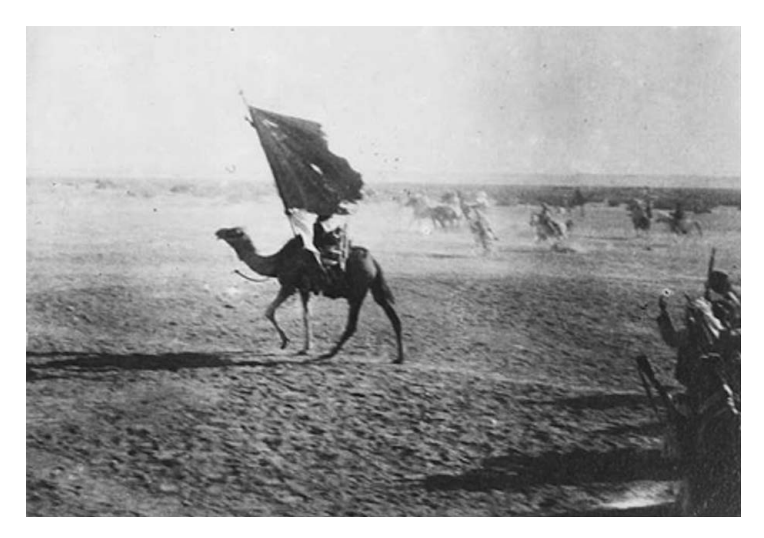
Fig. 9: The triumphal entry into Akaba, 6 July 1917, T.E. Lawrence Collection, Imperial War Museum, Q 59193.

the Emperor's forces in their surprise appearance,«<sup>125</sup> almost like a massive wall of camels when they hit the enemy lines during a full-speed advance.<sup>126</sup> As efficient mounted forces, the description of the sandworms and their final attack consequently closely match Lawrence's story about camels and their use during his campaigns.