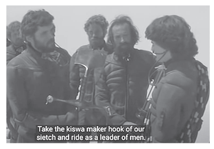
Fig. 4: Stilgar explaining how to ride the sandworm on Arrakis to Paul, Dune (1984).