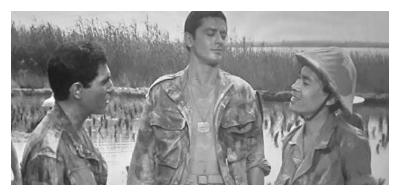
Fig. 2: Alain Delon in Lost Command (1966, dir. Mark Ronson).