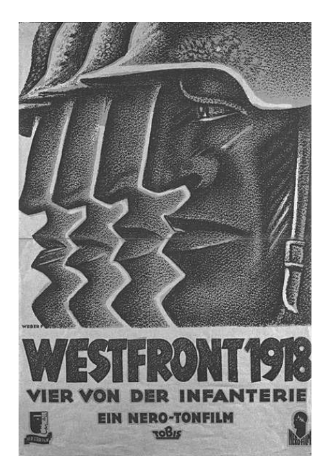
Fig. 1: Movie Poster Westfront 1918.

War but also, with some specific variations, for the Vietnam War in unusual movies like Francis Ford Coppola's Apocalypse Now (1979) and Michael Cimino's The Deerhunter (1978), extending to Oliver Stone's Platoon (1986) and Stanley Kubrick's Full Metal Jacket (1987) (although Vietnam created the opportunity to implement some specific variations).<sup>5</sup>