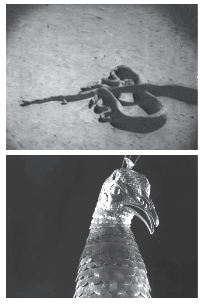
Figs. 1 and 2: Snakes in II grido dell'aquila and mechanical peacock in October .