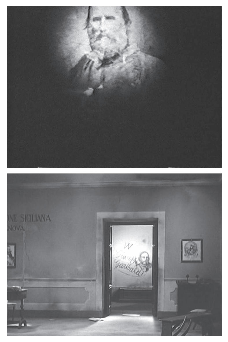
Figs. 7 and 8: Effigies of Garibaldi in II grido dell'aquila and 1860 respectively.