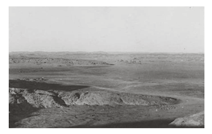
Fig. 2: View of the desert near Wejh; T.E. Lawrence Collection, Imperial War Museum, Q 59014.