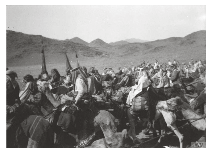
Fig. 10: Ageyl bodyguard, n.d.

rial worlds both represent and the indigenous one the two men dive deep into. Lawrence's superiors also had no doubt at all that it was the part played by the British officers that was decisive for victory, an aspect that Herbert, consciously or unconsciously, also emphasized, as the Fremen only began to be successful in their military operations after Paul joined them.