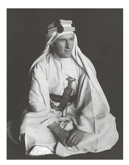
Fig. 1: T.E. Lawrence; T.E. Lawrence Collection, Imperial War Museum, Q 73535.

while the British officer coordinates the military actions of the indigenous people and in a way solely uses their potential in the name and for the sake of the British Empire, which Lawrence initially seems to have wanted to avoid so as to create an independent Middle East instead, Paul not only uses the Fremen locally but leads them straight into an intergalactic jihad. Other Western powers had tried to exploit the idea of a holy war of the Muslims against foreign rule before, but Lawrence acted rather pragmatically, and Feisal seemed politically experienced enough not to mix religion and politics. While Paul is also the center of a myth related to his military victories and his final