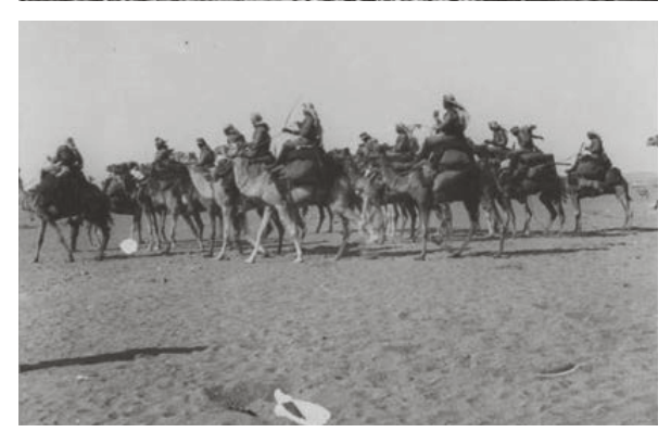
Fig. 6–8: Images of Camels related to Lawrence's operations, 1916–1918; T.E. Lawrence Collection, Imperial War Museum, Q 59073, Q 58861 and Q 59018.