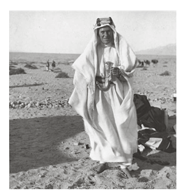
Fig. 3: T.E. Lawrence, n.d.; T.E. Lawrence Collection, Imperial War Museum, Q 59314.