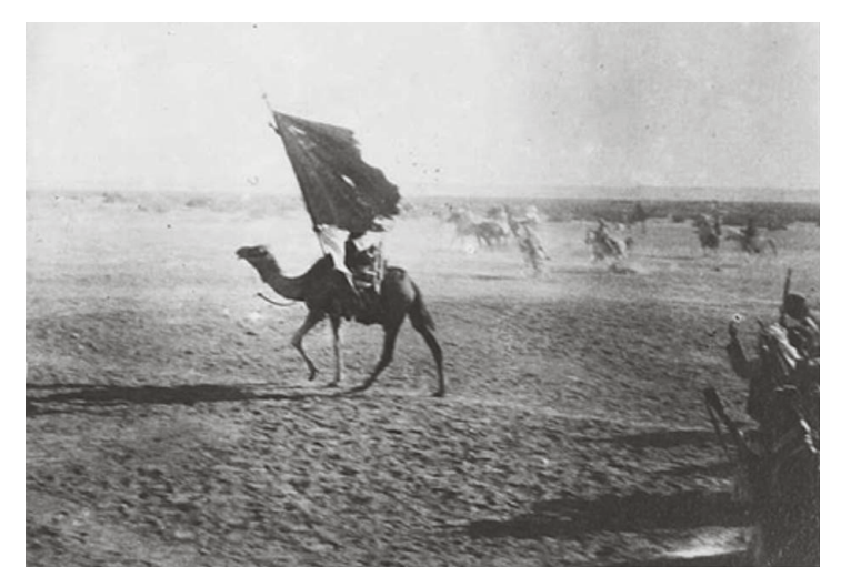
Fig. 9: The triumphal entry into Akaba, 6 July 1917, T.E. Lawrence Collection, Imperial War Museum, Q 59193.

the Emperor's forces in their surprise appearance,«<sup>125</sup> almost like a massive wall of camels when they hit the enemy lines during a full-speed advance.<sup>126</sup> As efficient mounted forces, the description of the sandworms and their final attack consequently closely match Lawrence's story about camels and their use during his campaigns.