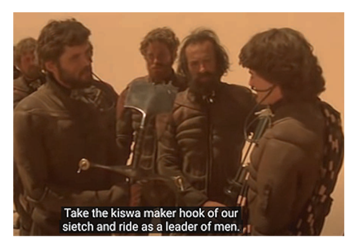
Fig. 4: Stilgar explaining how to ride the sandworm on Arrakis to Paul, Dune (1984).