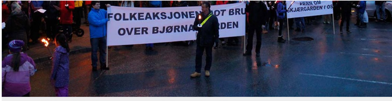
Over 500 møtte i fakkeltoget då folkeaksjonen arrangerte protestmarsjen i januar 2013

example also of how traditional forms of citizen activism merge with digital tools such as online petitions and social media.