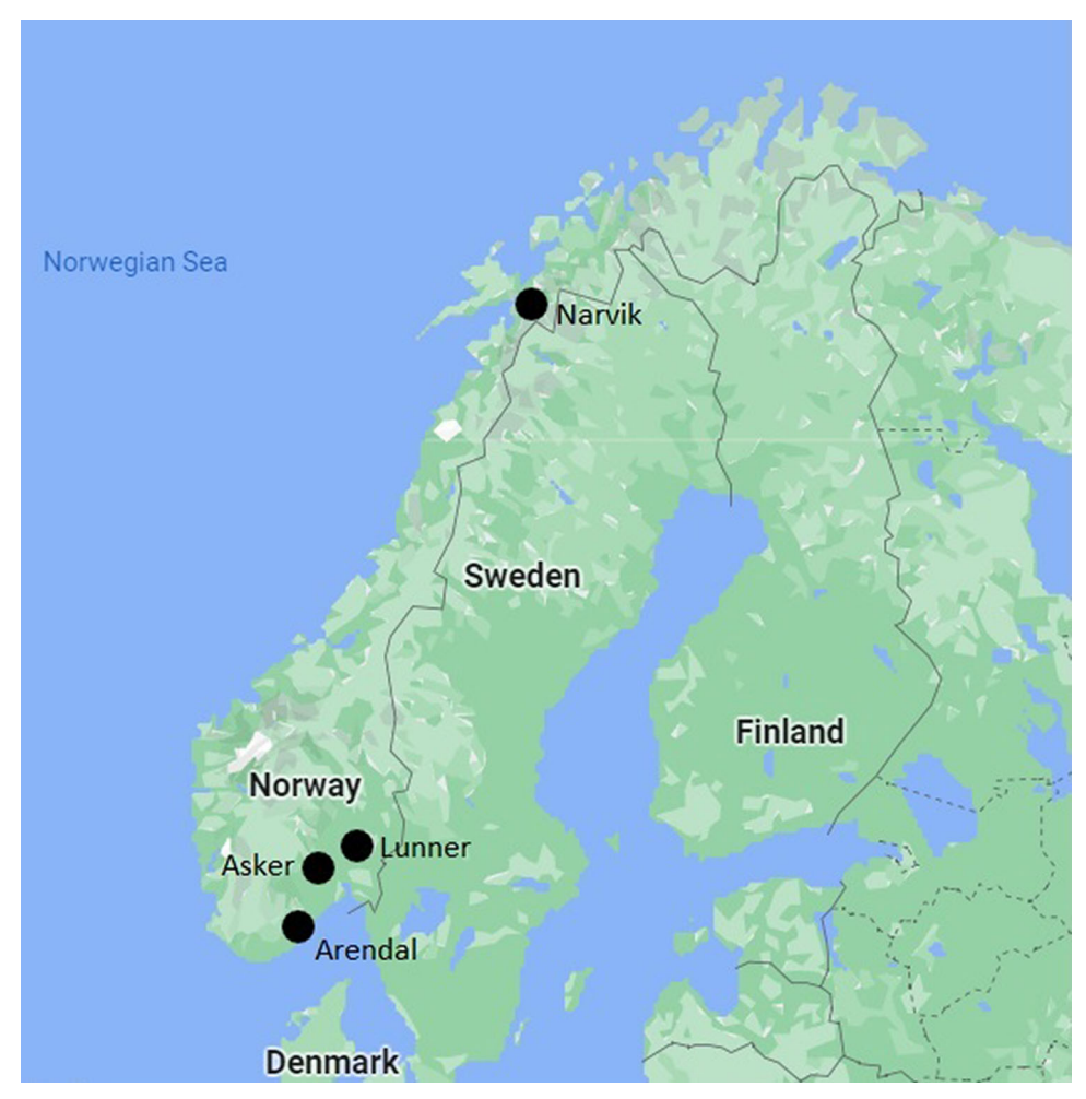
Figure 1. Map of Norway marking the case municipalities in this study.

on their experiences of these processes, what other municipalities could learn from them and how the SDGs were followed up in subsequent planning. The interviews were conducted digitally or by telephone, audio recorded and later transcribed. All quotes from interviews and documents have been translated from Norwegian by the authors.