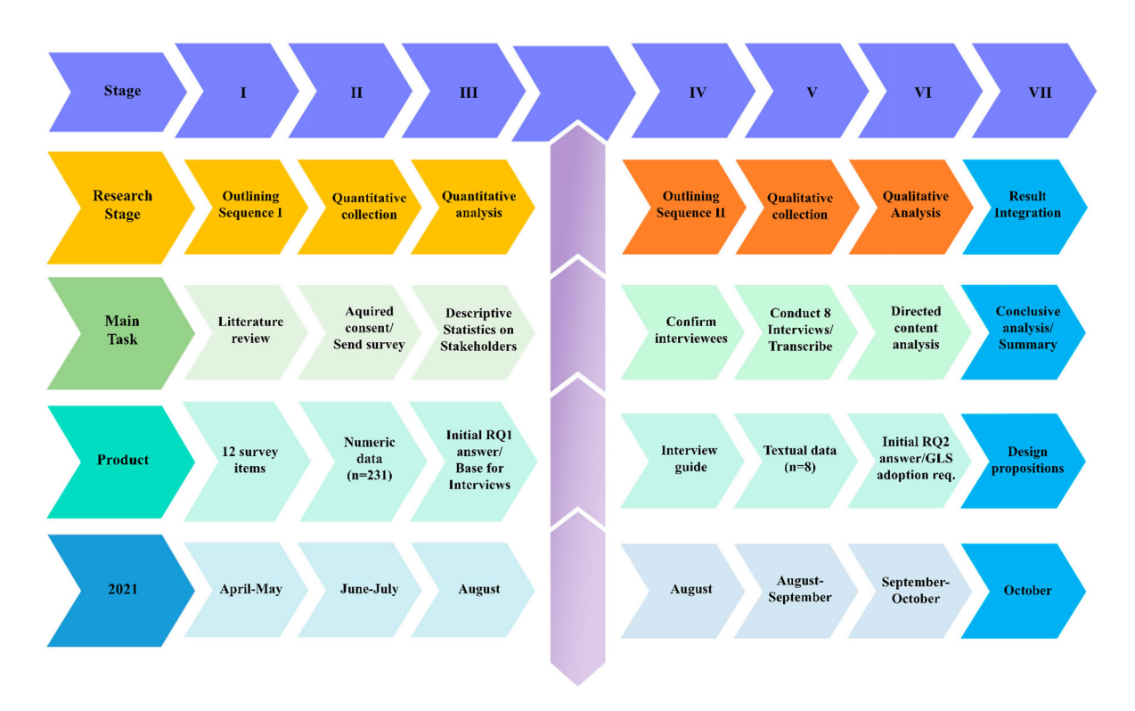
Figure 1. Research design overview.

When the company received a financial blow during the pandemic, reconstruction ideas came to the fore. The core ambition of the reconstruction project was to cultivate a learning culture that enhanced the organisation's overall learning and development, for instance, by facilitating departmental knowledge exchange. The project was officially presented at Tech-Com in December 2019 and was initiated in Q4 2020, roughly half a year after the schedule due to COVID-19. The task group implemented various strategies, processes, and technologies in this first phase, including the following: