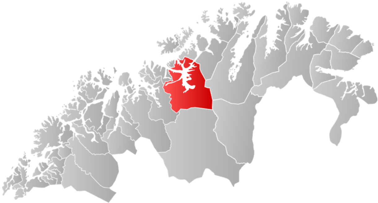
Figure 1: Map of Troms and Finnmark County, with the municipality of Alta marked red.

Alta municipality is situated in Northern Norway, specifically in Troms and Finnmark County, positioned well above the Arctic Circle at 70 degrees north (Fig.1). The town of Alta serves as the administrative hub of the municipality, strategically located at the convergence of the Altafjord, the Alta River, and the vast high plains of Finnmark known as the "vidde."