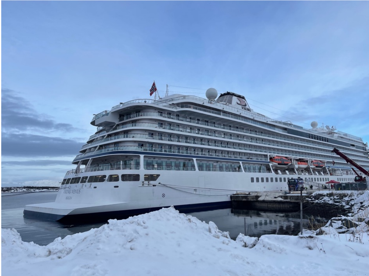
Cruise ship docked at the terminal quay in Alta.

Alta harbor, located near the city's airport, requires vessels planning to enter the caution area in proximity to the airport to report to the control tower. To accommodate larger cruise ships, Alta Municipality is in the process of planning a larger quay situated further away from the airport. Refueling of cruise vessels is facilitated using a fuel truck. The utilization of Alta harbor's infrastructure incurs costs for cruise ships, including quay charges based on the length of stay, a harbor charge for safety and accessibility, a passenger fee of 10 NOK per person, and an administration fee per call.