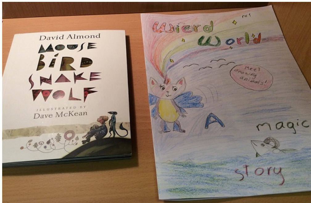
Figure 2. Weird World: Meet amazing animals!

4. What was the wolf's backstory? Why did she turn ferocious? Write half a page about the wolf's previous experiences, including a shocking event which led to her turning savage. Feel free to draw the wolf as well.