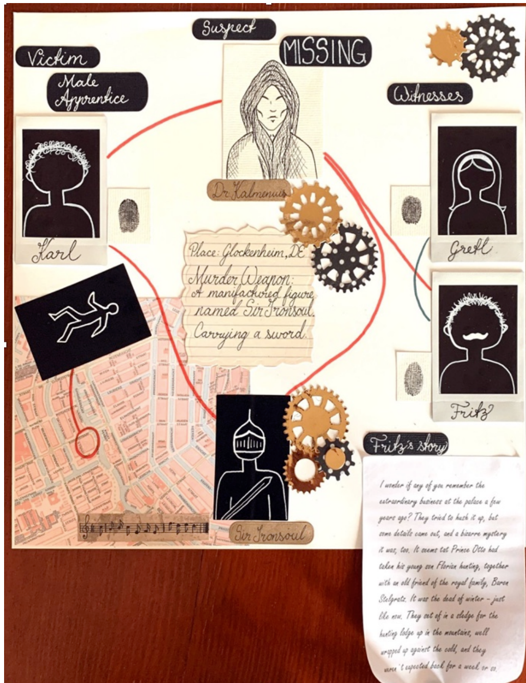
Figure 1. Student teacher's Crime Board based on Clockwork

2. Create a crime board featuring one of the crimes in the story. Describe where the crime takes place, and include a map, the murder weapon, and some of the main characters. Mark the characters as victim, suspect, and witness(es). (See Figure 1 for a student teacher's crime board based on Clockwork .)